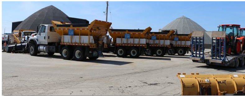
Salt storage at the existing Mavis Works Yard

The City has grown substantially over the last 20 years and development continues to intensify. In order for the Roads Service Area to meet maintenance and operational service levels in the coming years, investment in an additional works yard is required.