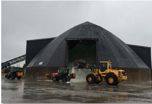
Salt storage dome at the Mavis Works Yard

All four works yards were awarded the Safe and Sustainable Snowfighting Award in 2016 from the Salt Institute, for excellence in environmental consciousness and effective management in the storage of winter road salt.