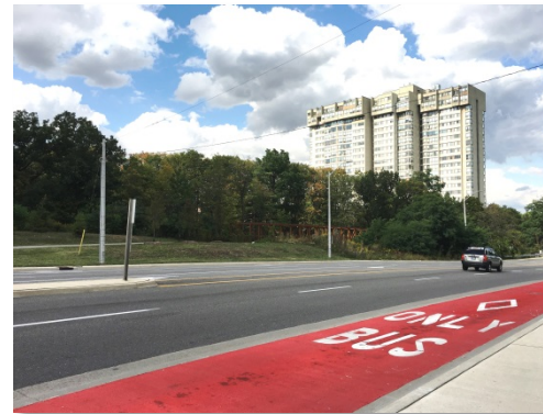
Marked bus bay on Burnhamthorpe Road East, looking towards the Cooksville Creek Bridge and Burnhamthorpe multi-use trail

Overarching themes for this service area continue to be public safety, responsible delivery and maintenance of infrastructure, and ensuring infrastructure is in a state of good repair.