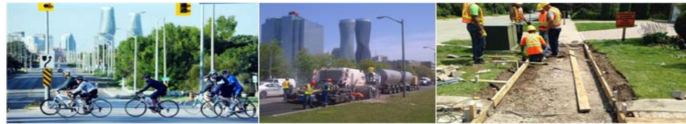
Mississauga cyclists, road and sidewalk construction