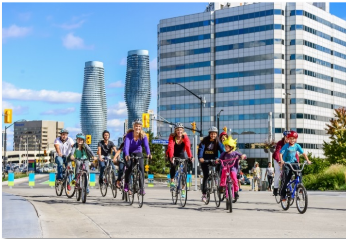
Cyclists in Celebration Square

The City landscape is changing, future transit and infrastructure demands on the Roads Service Area require planning, development and implementation of forward-thinking Master Plans (for example, the Transportation, Cycling and Pedestrian Master Plans) to position ourselves as a progressive service area and municipality. Regional transit planning with a focus on multi-modal transportation is a key focus in our Master Plans. Phased implementation of the Cycling Master Plan, along with additional funding for the Active Transportation Office's marketing and education strategy, will allow the City to continually improve our multi-modal transportation system and resources available to residents.