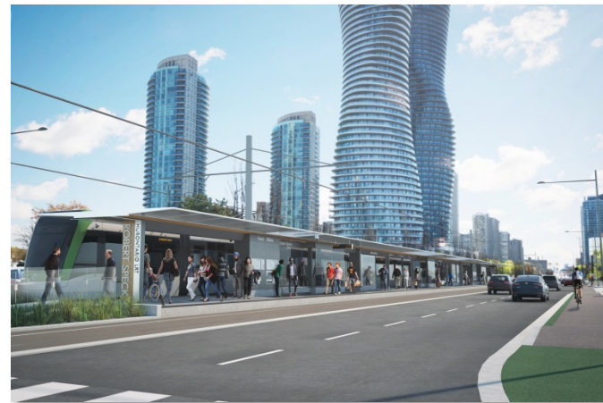
Rendering of the HuLRT Robert Speck Parkway stop

With the implementation of the Hurontario Light Rail Transit (HuLRT) Project, there will be additional long term operations and maintenance costs associated with the enhanced streetscape and "Complete Street" requirements of the project that will have to be accommodated within future operating budgets. Additional operations and maintenance costs will arise from wider sidewalks, boulevard cycling facilities, decorative paving treatments, and enhanced cross walk paving treatments; street furniture including benches, bike racks, and waste receptacles; and bollards, retaining walls and noise walls. Additional snow removal will also be required within the boulevard areas to address the cycling facilities, wider sidewalks and general lack of snow storage opportunities with the enhanced streetscape elements.