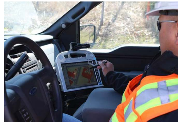
Staff member using mobile technology to enhance productivity and co-ordination in the field