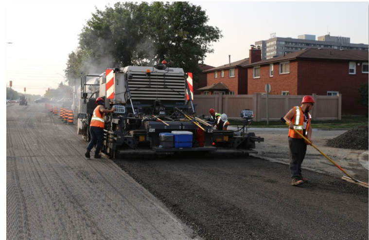
Asphalt Recycling on Central Parkway

To meet the demands of the City's aging infrastructure, it is essential to have appropriate asset management systems in place. The Roads Service Area operates and maintains the City's largest owned asset (roads and bridges); therefore, we must continually invest in and build on a system to manage these assets. Through partnerships with the Information Technology (IT) Division, Roads plans to implement progressive mobile technology to inventory and inspect assets in the field and have that data integrate with all other City systems. With linkages to the City's Geospatial Master Plan, there is an opportunity to implement improved tools to manage and maintain road-related asset data in a spatial environment. Streamlined asset management within the Roads Service Area ensures that staff can efficiently gather, integrate and use road-related asset data, in order to ensure that these assets remain in a state of good repair.