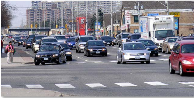
Rush hour traffic on Hurontario Street

Mississauga continues to mature as a city. Aging infrastructure and the need to balance service levels with affordability pose significant pressures and challenges for this service area. Through comprehensive condition assessments and asset management plans, the City continues to mitigate potential risks. Traffic congestion remains high on the public agenda. Growth within our City and surrounding municipalities, along with increased demand for the delivery of goods, continues to put additional pressure on Mississauga's road infrastructure.