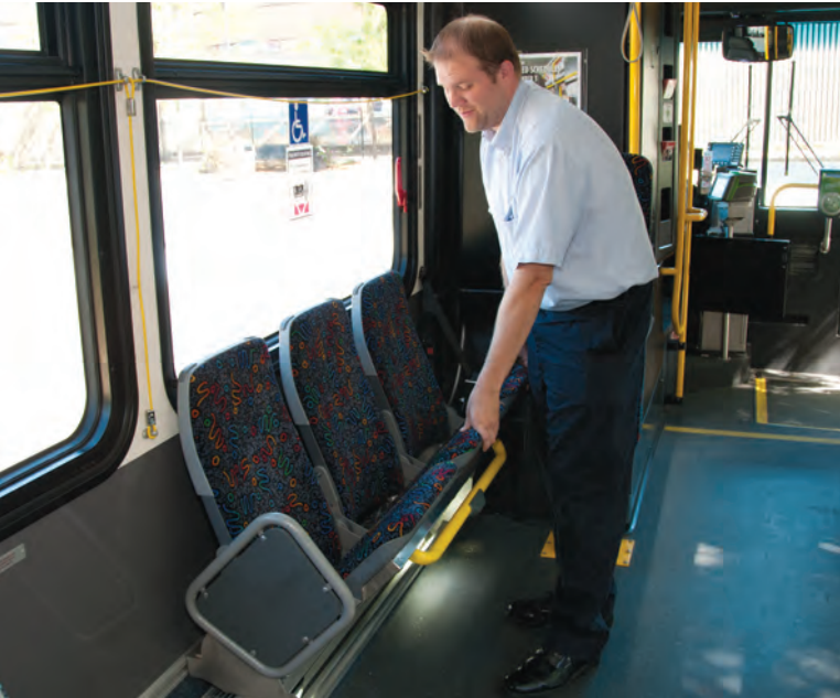
10 ACCESSIBLE BUS SERVICES