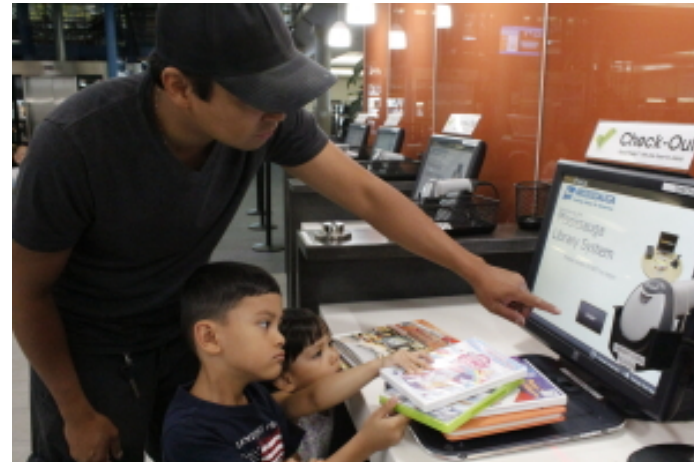
Central Library Self Check-out