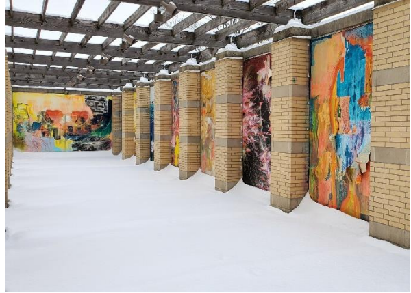
Figure 3: Finding Home, 2019, Mango Peeler and Mississauga Youth Artists