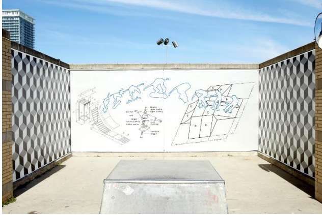
Figure 2: Backside Flip, 2013, Dan Bergeron