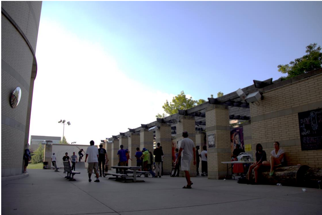
Figure 1: Sculpture Court Skate Park in action

This project will be replacing two existing mural series, “ Finding Home ” and “ Backside Flip ”, which are in need of replacement due to deteriorating wall conditions. Backside Flip was created in 2013 by artist Dan Bergeron. The mural depicts a series of silhouettes of a skateboarder performing a backside flip alongside technical-style drawings of ramps. The work is intended to re-animate public space and reflects both the grace and complexity of skateboarding. Finding Home , completed in 2019, was co-created by artist Mango Peeler and nine local emerging artists as part of National Youth Arts week. The project provided an opportunity for emerging artists to celebrate and showcase their art, talent, and ideas.