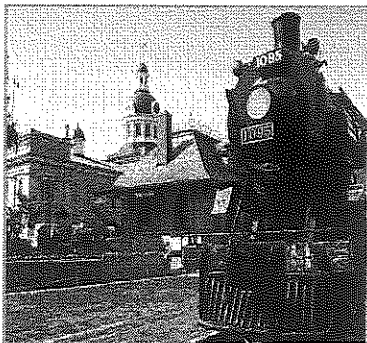
Above: Engine 1905: "Spirit of Sir John A."