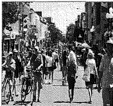
Above: Princess St., Kingston

10:40 to 11:00 a.m. Break and Supplier Showcase