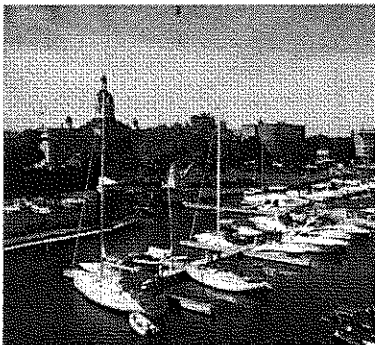
Above: Kingston Harbour