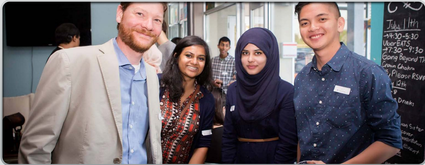
Professionals working for Environmental Non-Profits