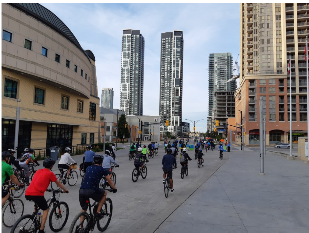
Tour de Mississauga 2019 start, heading west onto City Centre Drive.