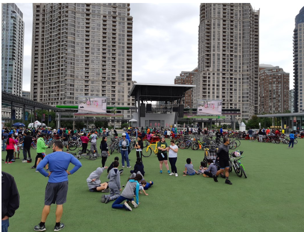
Celebration Square after the return of most riders.