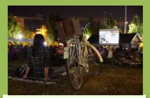
Bike-In Movies welcome cyclists to a public screening of a film – plenty of fun for the whole family!