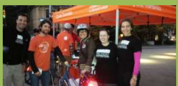
Volunteers with Cycle Toronto hand out lights to riders to keep them visible while riding at night