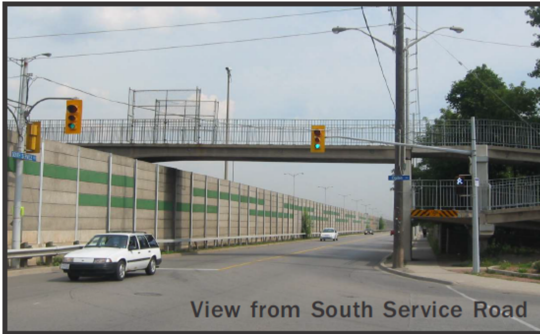
View from South Service Road