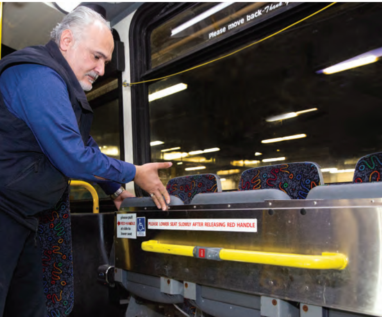
12 Accessible Bus Services