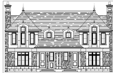
Condominium Semi-Detached Homes