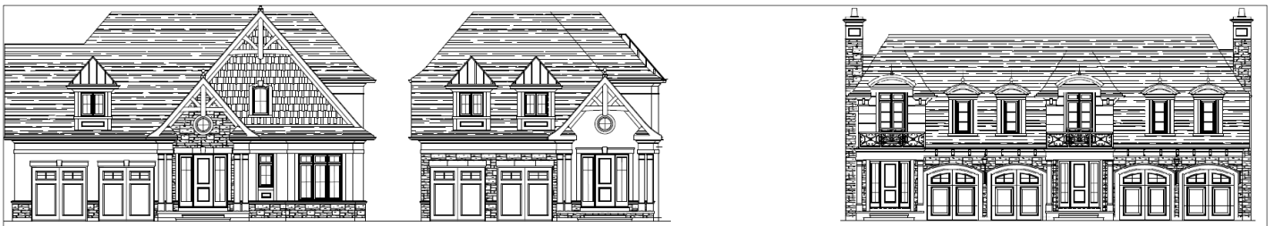
Freehold Detached and Semi-Detached Homes on Garden Road