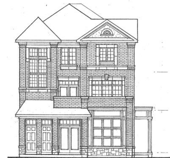
Mixed Use Building