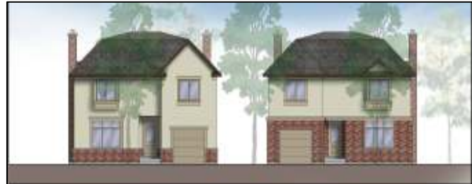
Proposed two detached homes