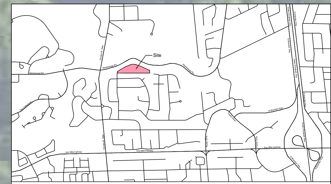
1 Key Plan 1.0 NTS