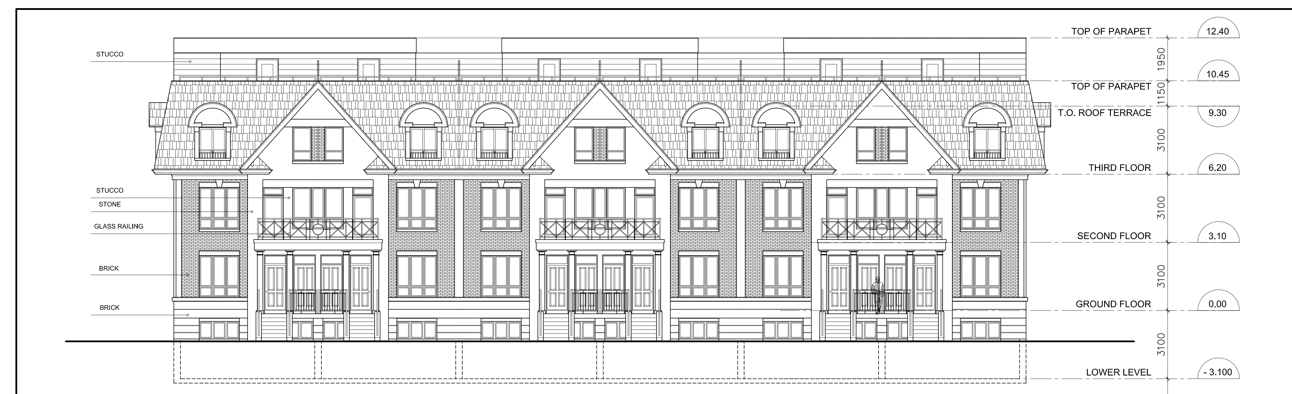
North Elevation 2 1:100 RZ-04