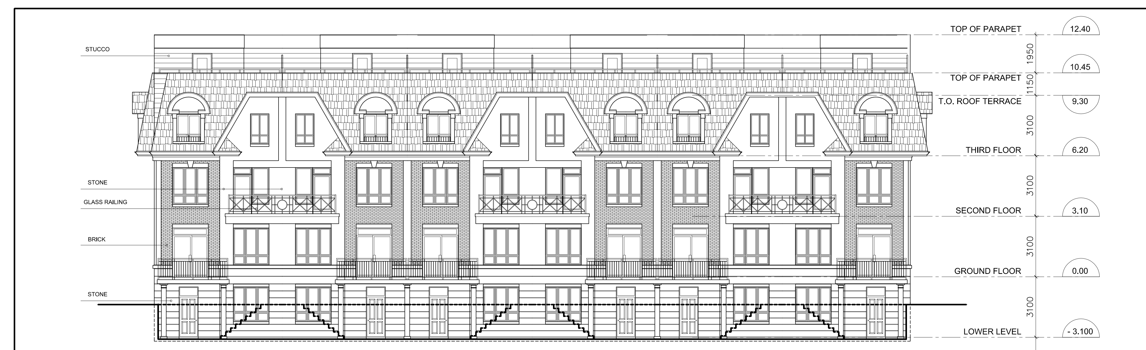
South Elevation 1 1:100 RZ-04