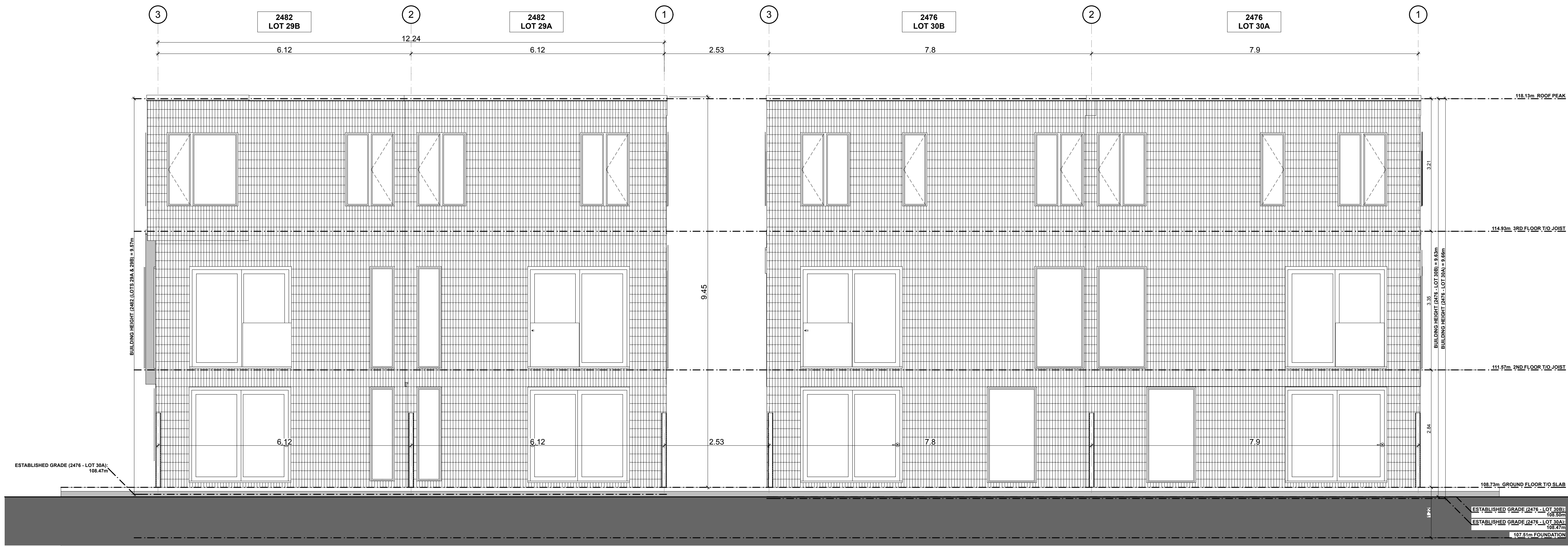
2 SOUTH ELEVATION SCALE: 1:50