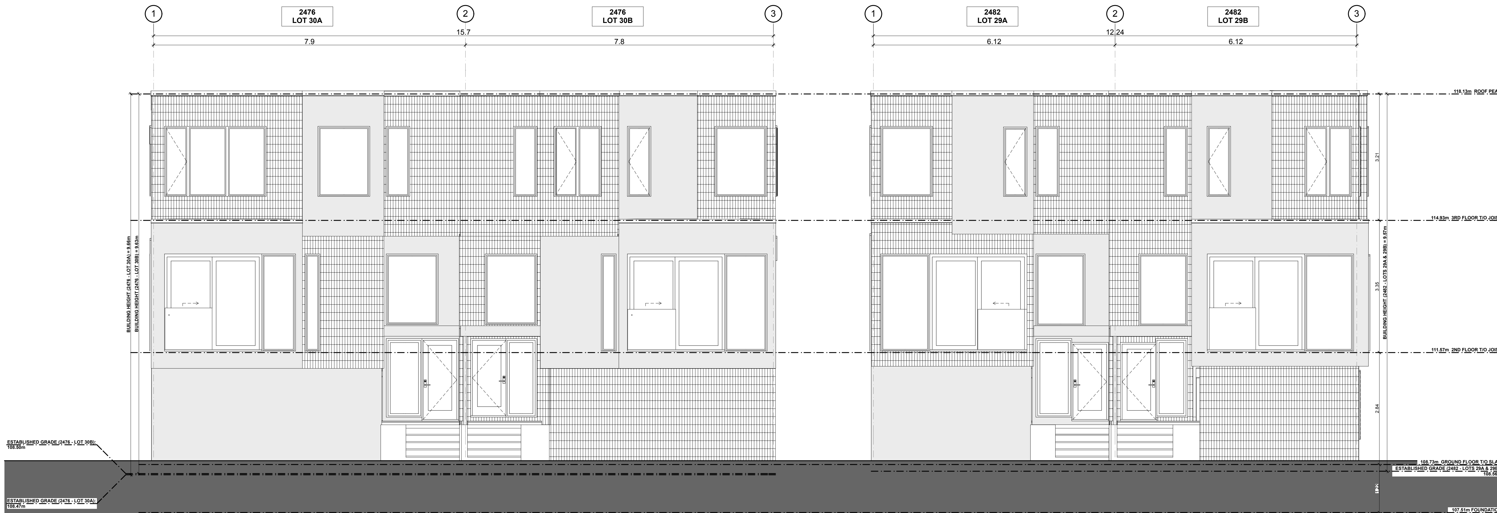
1 NORTH ELEVATION SCALE: 1:50