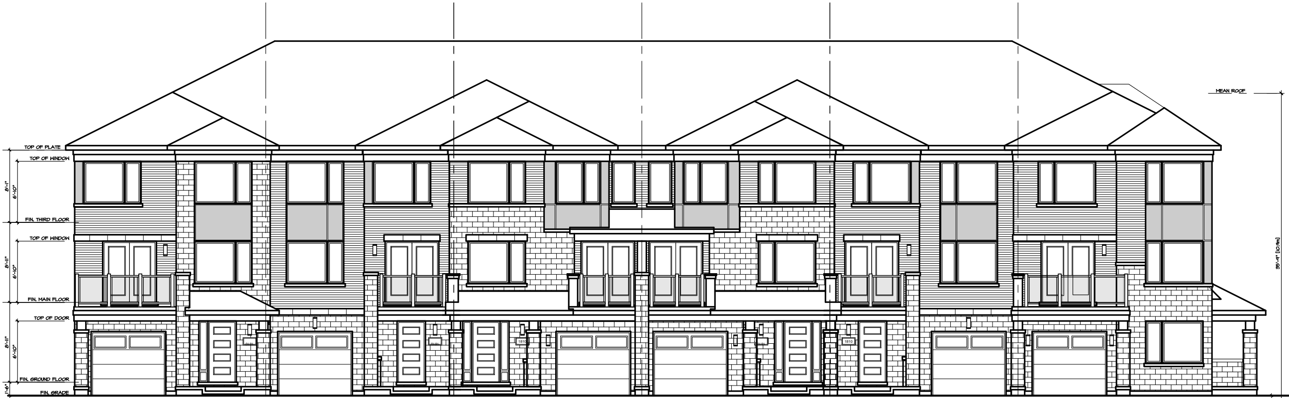
FRONT ELEVATION TRANSITIONAL