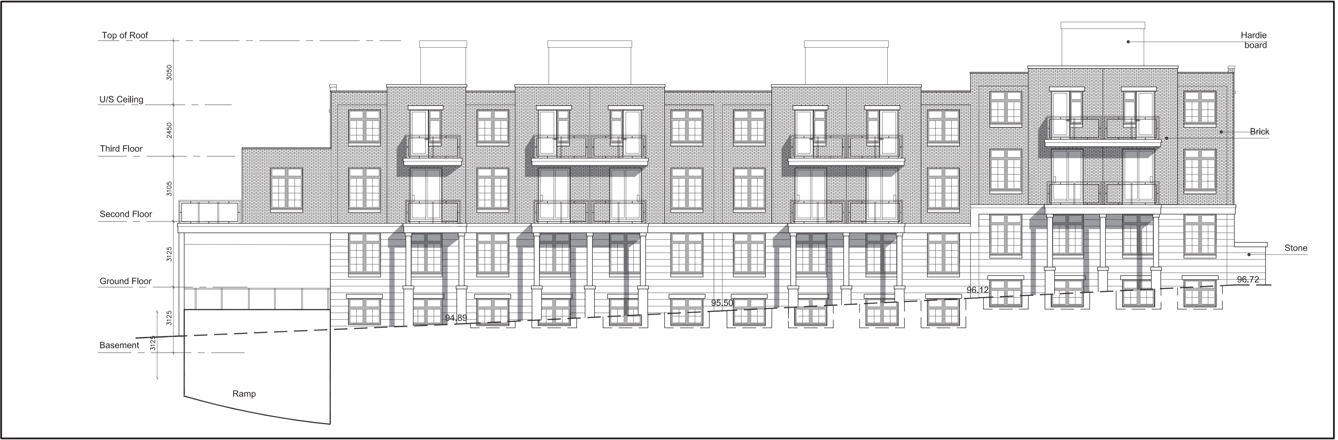
Building B North Elevation 1 1:100 RZ-05