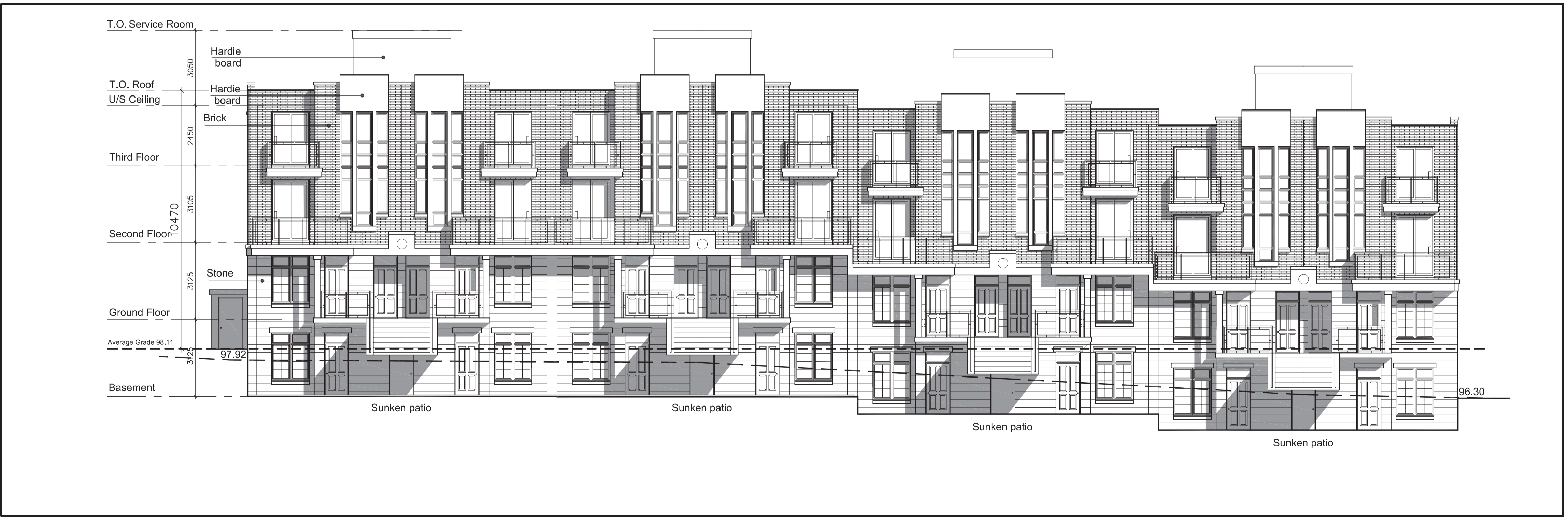
Building A South Elevation 1 1:100 RZ-04