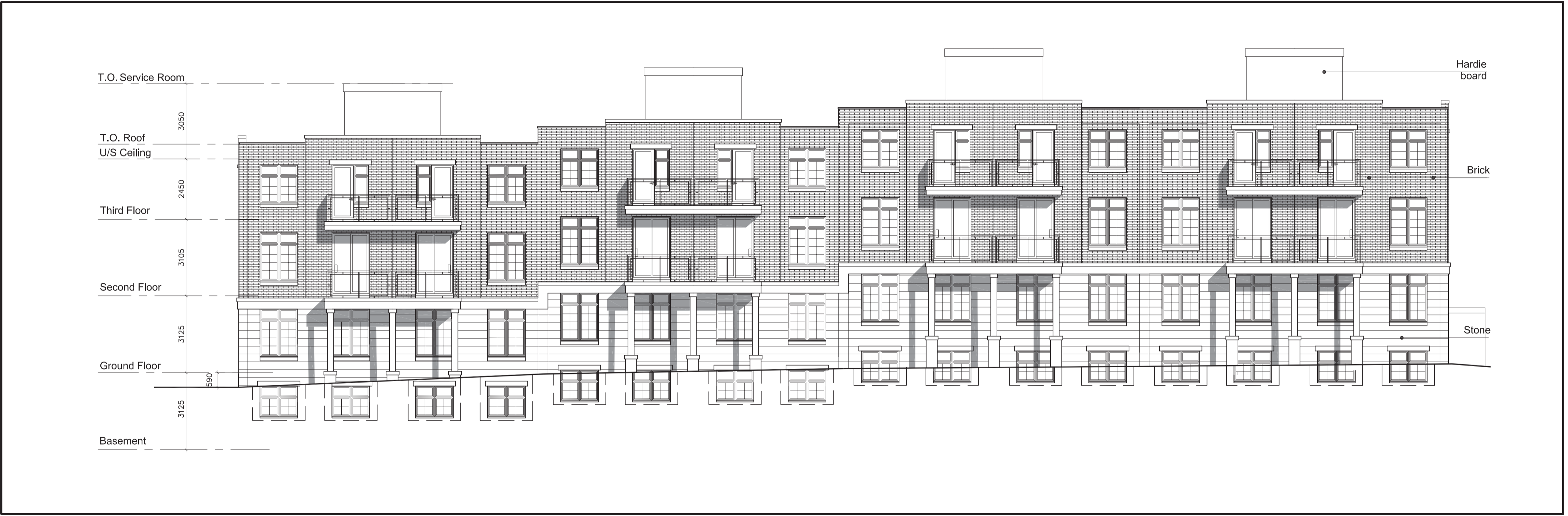
Building A North Elevation 2 1:100 RZ-04