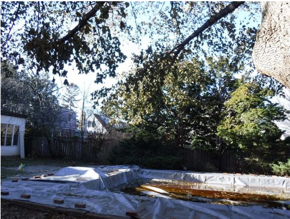
Photograph #1: Trees located on North-west side of the subject site