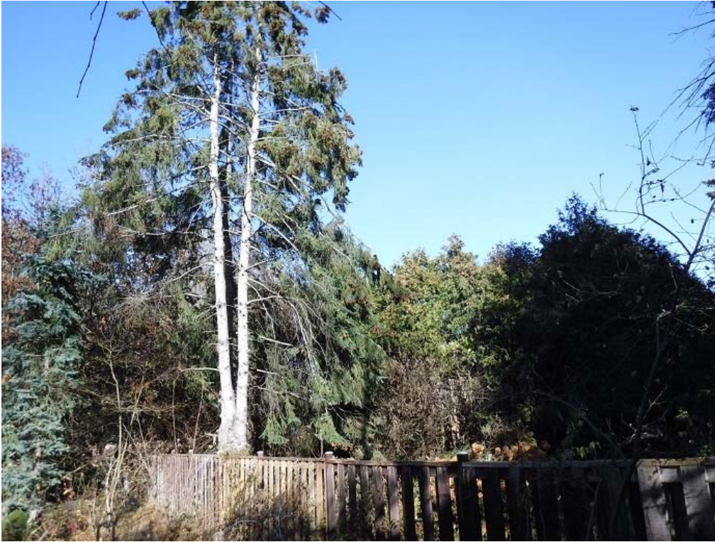
Photograph #1: Trees located on South side of the subject site