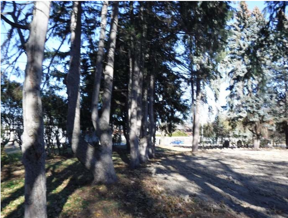
Photograph #1: Trees located on east side of the subject site