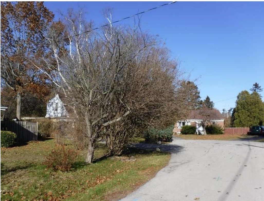
Photograph #1: Trees located on South-East (road) side of the subject site