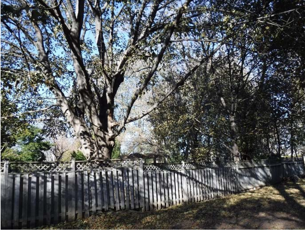
Photograph #1: Trees located on South-West side of the subject site