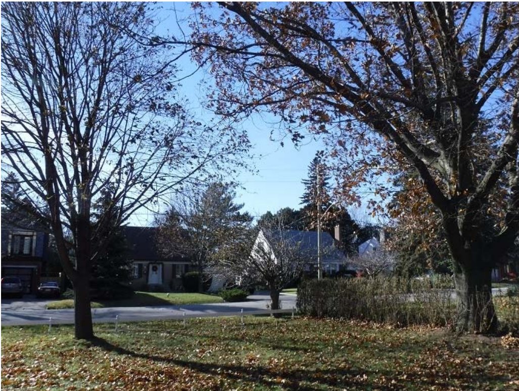
Photograph #1: Trees located on West (road) side of the subject site