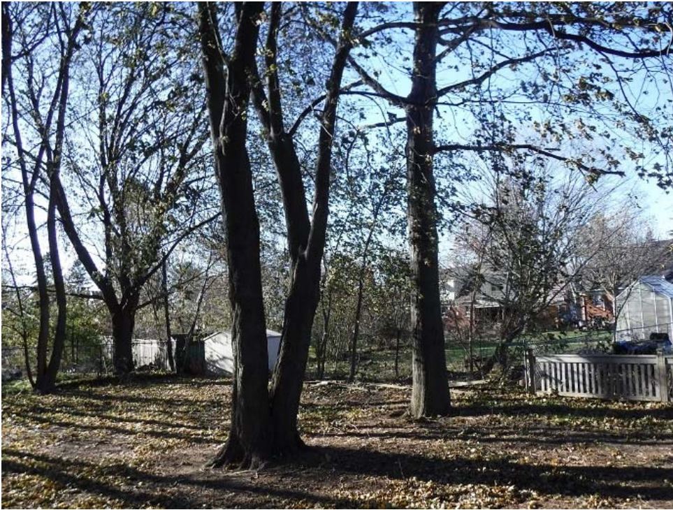
Photograph #1: Tree located on east side of the subject site