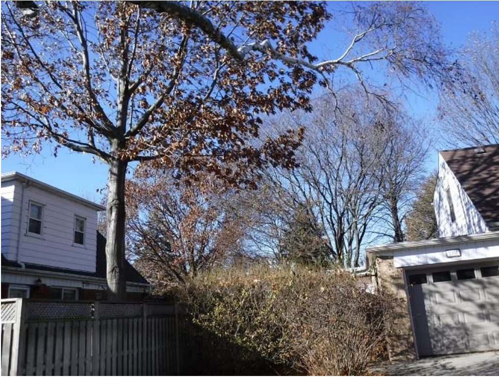
Photograph #1: Trees located on South-West side of the subject site