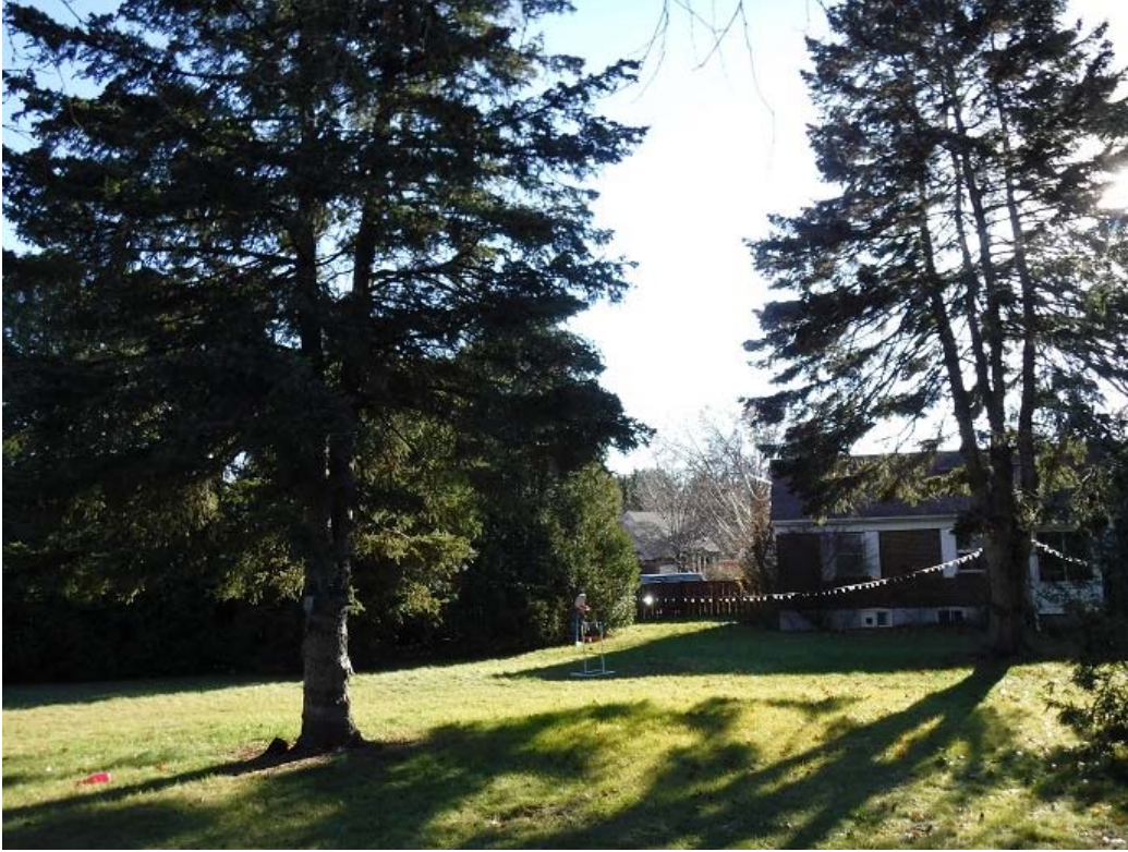
Photograph #1: Trees located on South-East side of the subject site