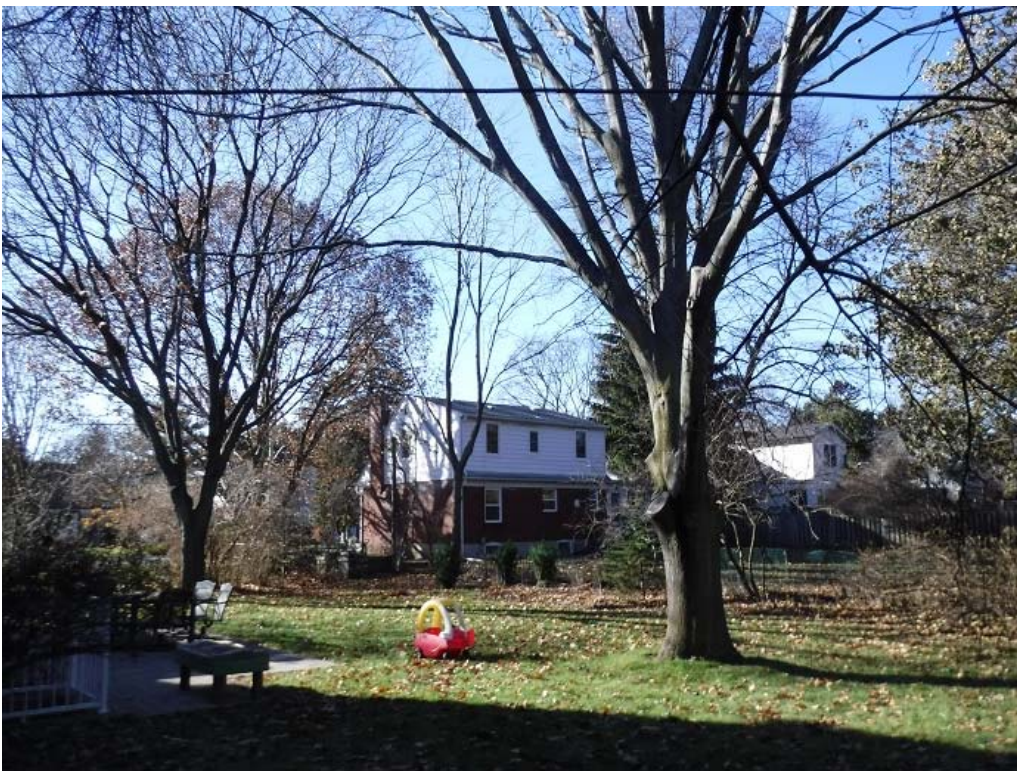
Photograph #1: Trees located on South-West side of the subject site