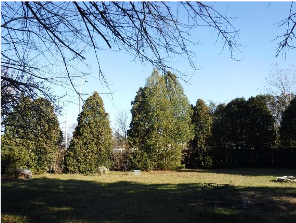
Photograph #1: Trees located on South-East side of the subject site