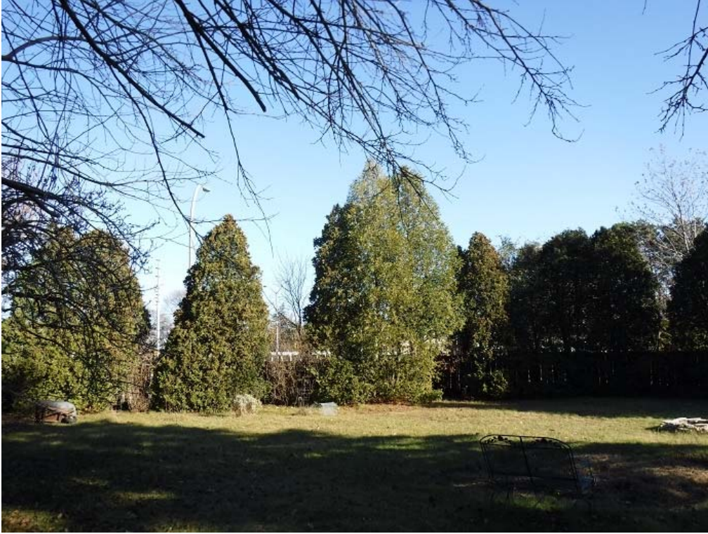
Photograph #1: Trees located on South-East side of the subject site