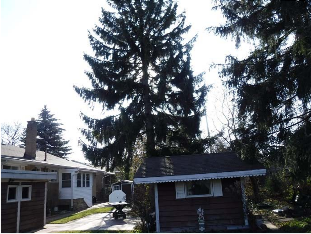
Photograph #1: Trees located on South side of the subject site