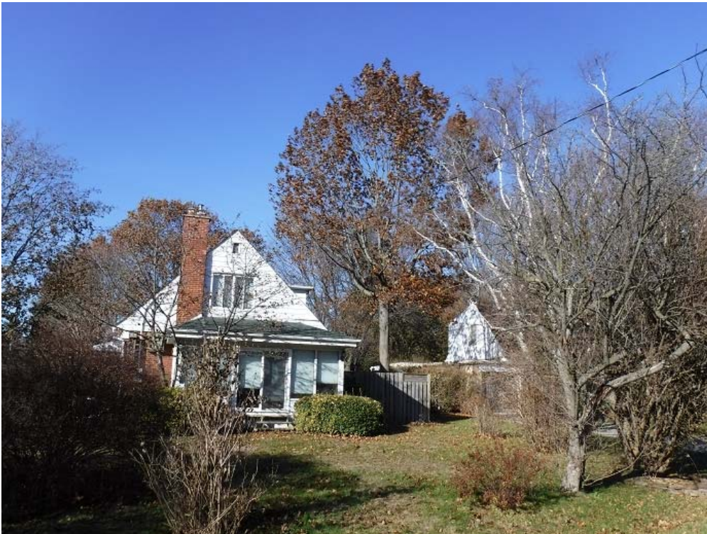
Photograph #1: Trees located on South side of the subject site