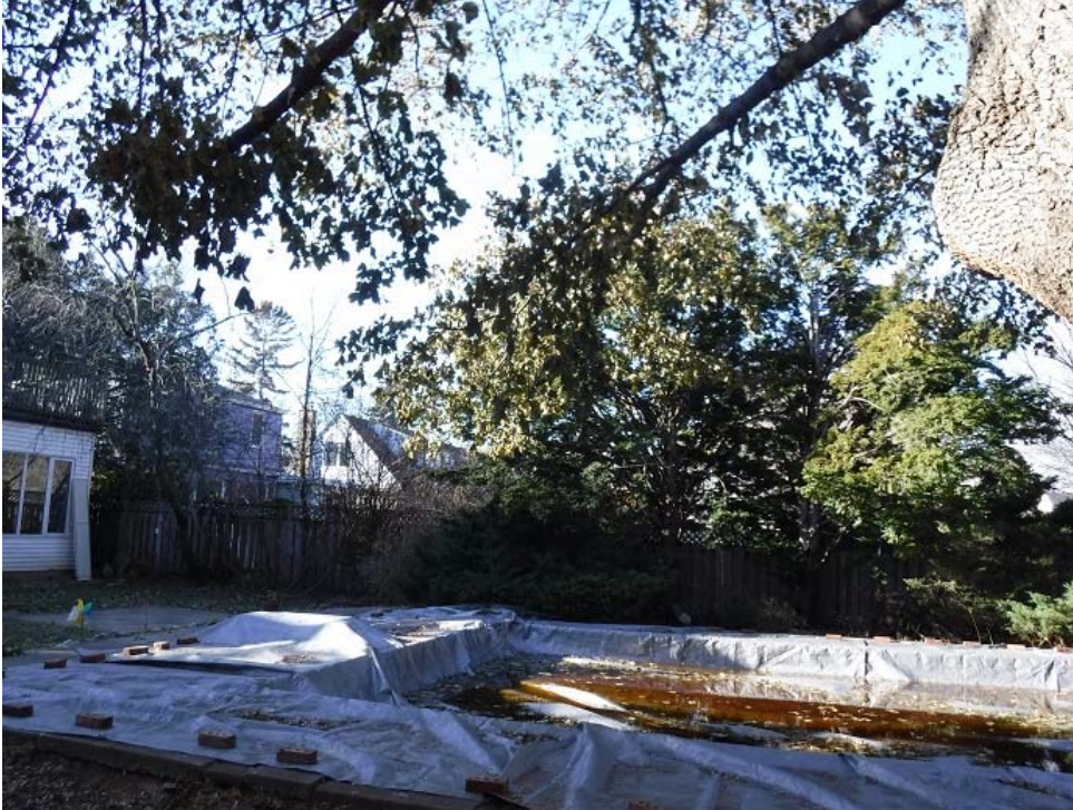
Photograph #1: Trees located on North-west side of the subject site