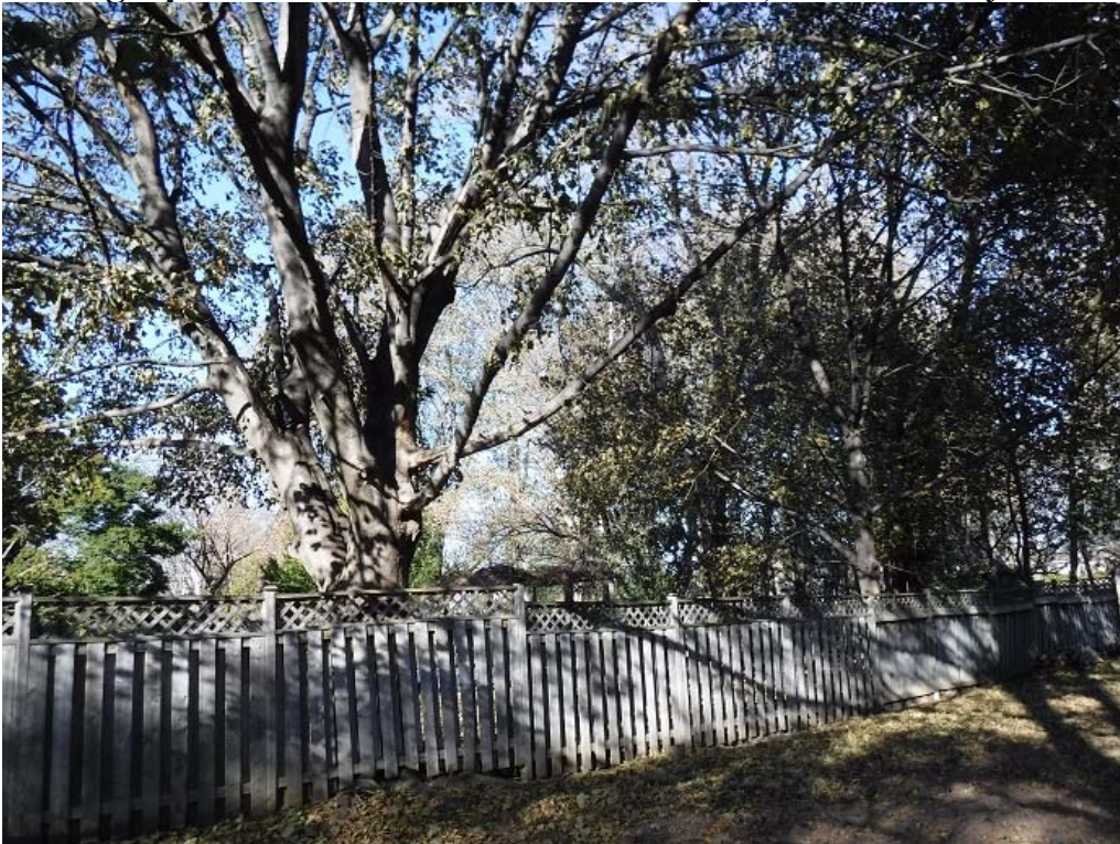
Photograph #1: Trees located on South-West side of the subject site