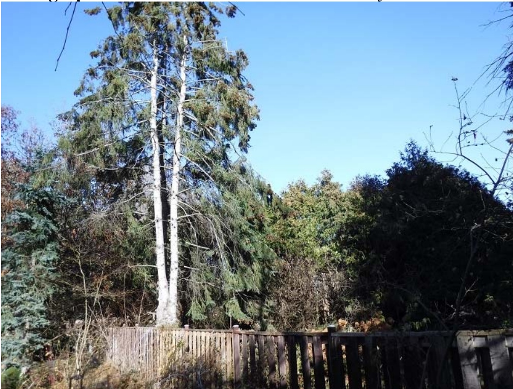
Photograph #1: Trees located on South side of the subject site