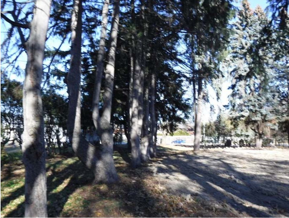
Photograph #1: Trees located on east side of the subject site