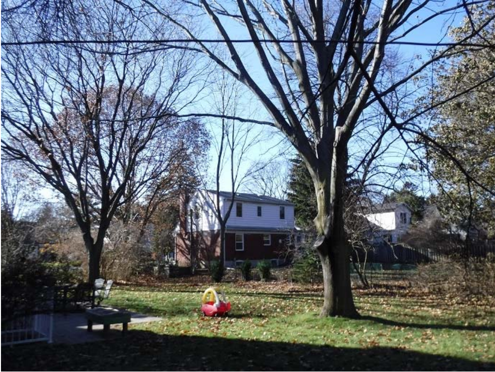
Photograph #1: Trees located on South-West side of the subject site