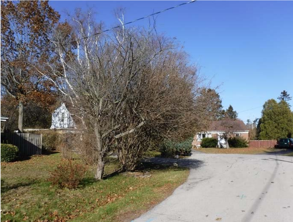
Photograph #1: Trees located on South-East (road) side of the subject site