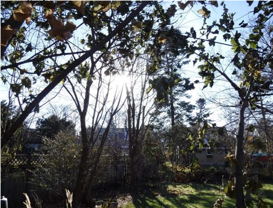
Photograph #1: Trees located on North-west side of the subject site