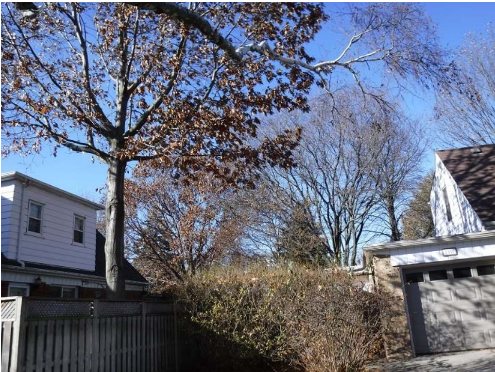
Photograph #1: Trees located on South-West side of the subject site