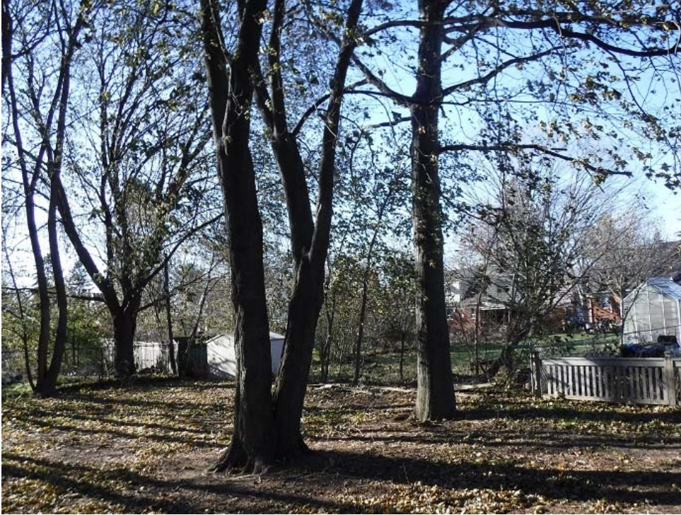
Photograph #1: Tree located on east side of the subject site