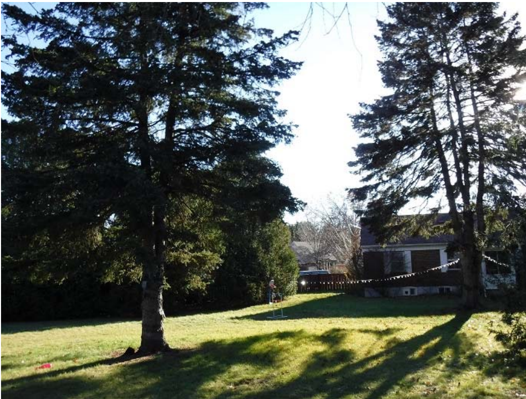
Photograph #1: Trees located on South-East side of the subject site