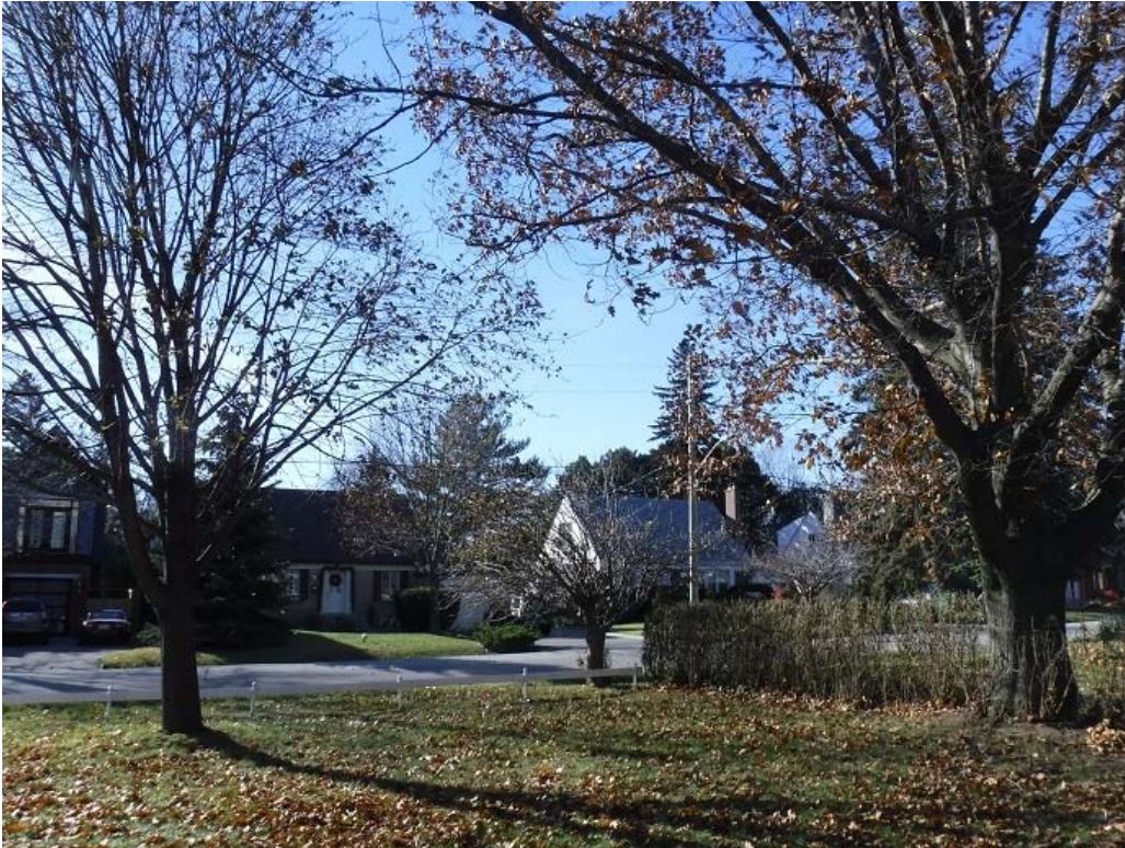
Photograph #1: Trees located on West (road) side of the subject site