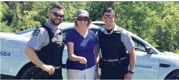
With City Security at Lake Wabukayne

Space is limited and on a first come, first served basis.