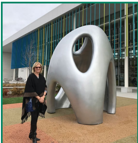
Meadowvale Community Centre public artwork Fossil Record