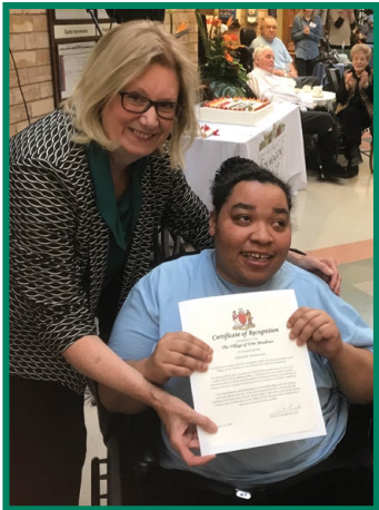
Presenting a certificate and celebrating the Village of Erin Meadows' 15th Anniversary