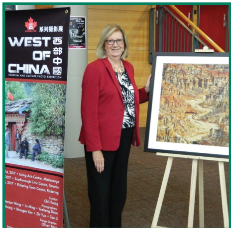
At the West of China Art Exhibit at the Living Arts Centre