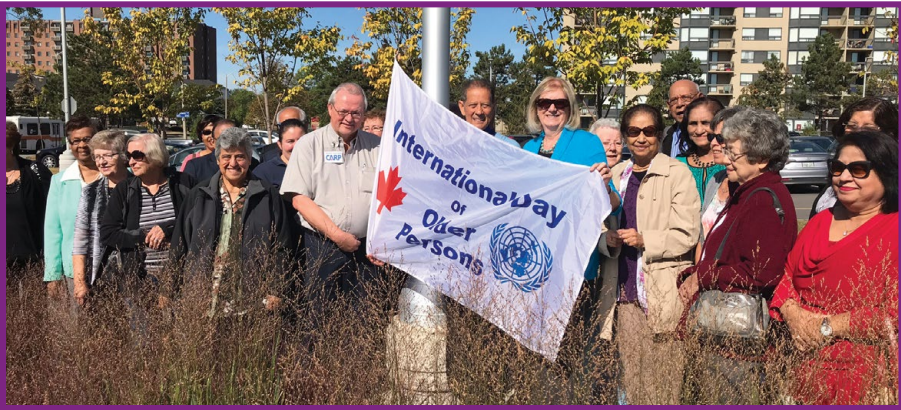
Celebrating United Nations Flag Raising on International Day of Older Persons