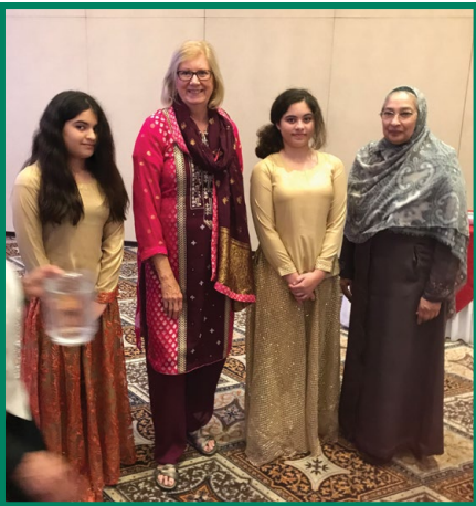
At the Muslim Council of Peel EID dinner