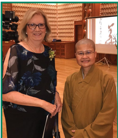
At the Fo Guang Shan Temple at the Buddha's Light Vegetarian Gala