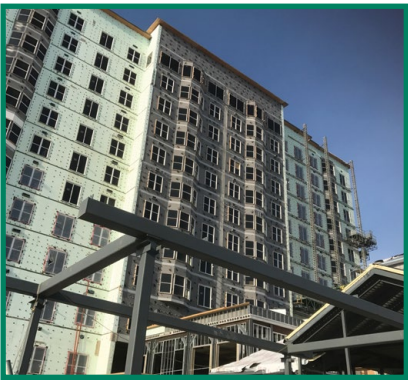
Phase II of the Village of Erin Meadows set to open Fall 2018

Finding affordable housing in Peel continues to be a challenge for more and more individuals and families in Peel. That is why Region of Peel Council continues to make it a priority to increase the supply of affordable housing. Specifically, we are focused on helping people on Peel’s centralized wait list for subsidized housing obtain a permanent place to live.