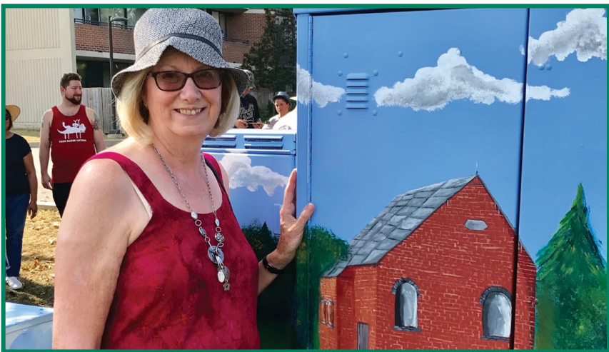
Unveiling utility box artwork on north side of Derry Rd. just east of Glen Erin Dr.

The Region has started the process of finding a contractor to design, build, operate and maintain the new facility. Construction of the new facility is expected to start in 2021 and be completed in 2023.