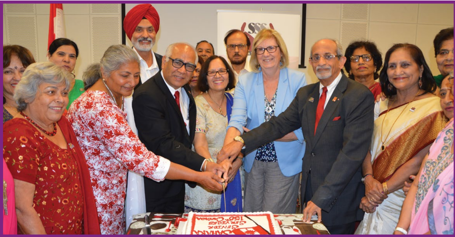
Celebrating Canada Day with the Sahara Seniors Club