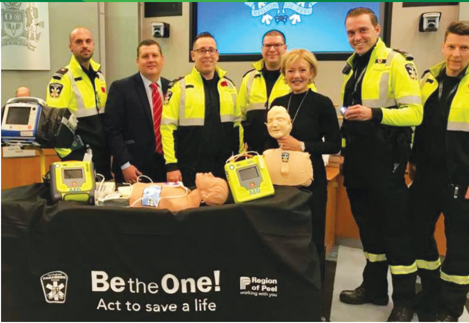
CPR with First Responders of Peel Paramedics

If you have questions about how to control fall cankerworms and gypsy moths on your property call 3-1-1 or visit mississauga.ca/2018spray . You can also sign-up for email alerts and access up-to-date information on aerial spraying such as road closures, spray dates, times and locations.