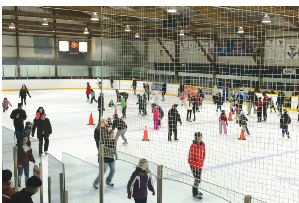
Annual Ward 8 Family Fun Skate at Erin Mills Twin Arena