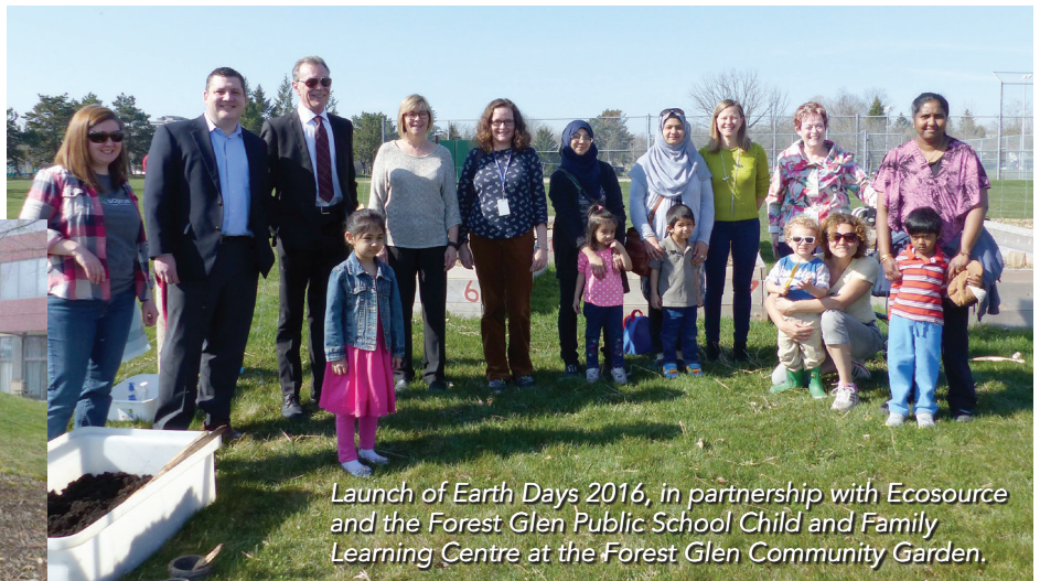
Launch of Earth Days 2016, in partnership with Ecosource and the Forest Glen Public School Child and Family Learning Centre at the Forest Glen Community Garden.