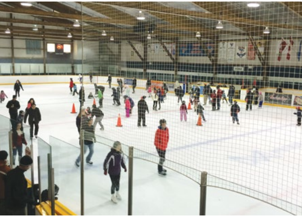
Erin Mills Twin Arena

Stay tuned for upcoming events taking place this winter in Ward 8 including the annual Ward 8 Fun Skate. Visit mississauga.ca/ward8 to join my mailing list to receive event details.