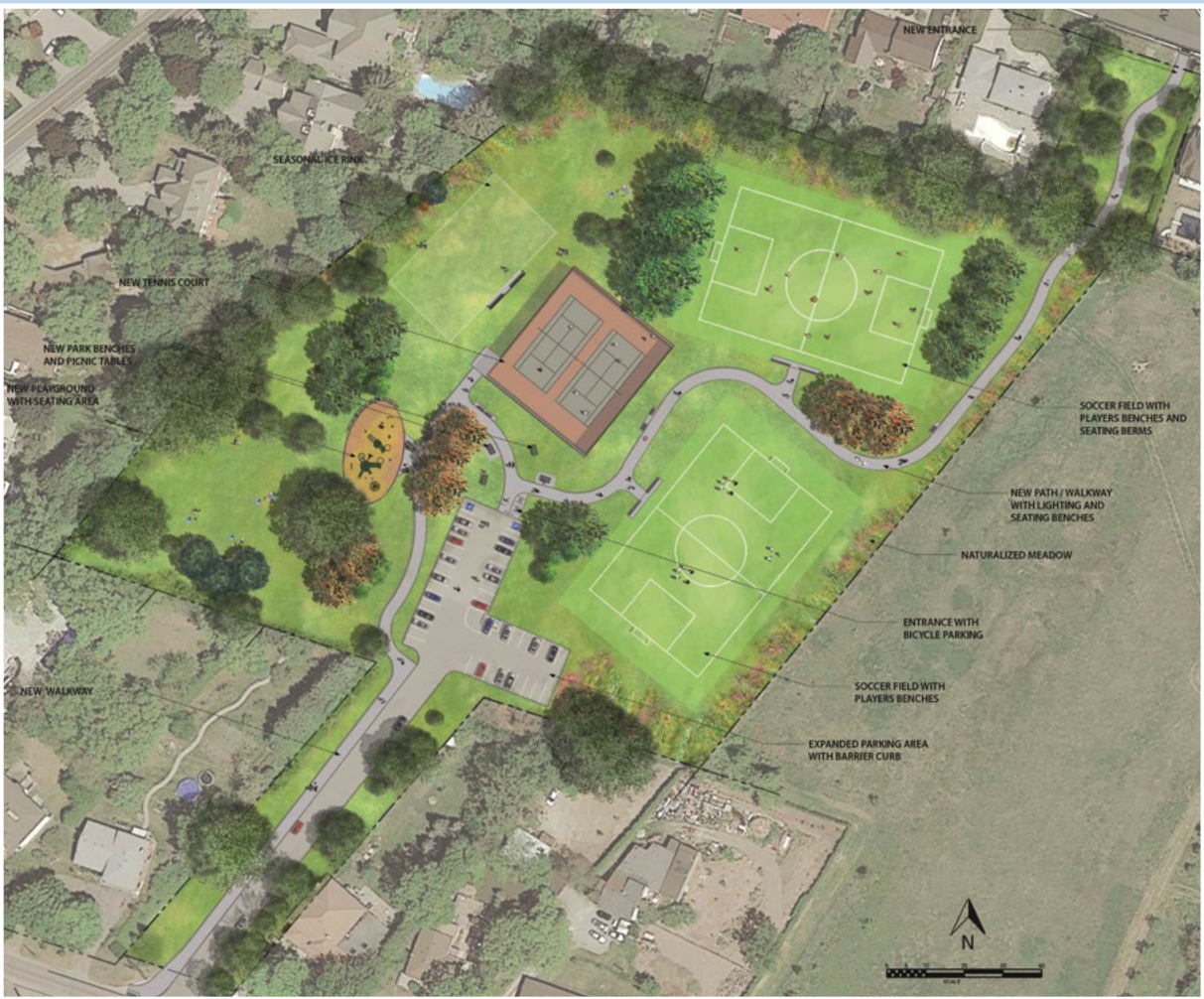
BRUCE REYNOLDS PARK - PROPOSED PARK IMPROVEMENTS