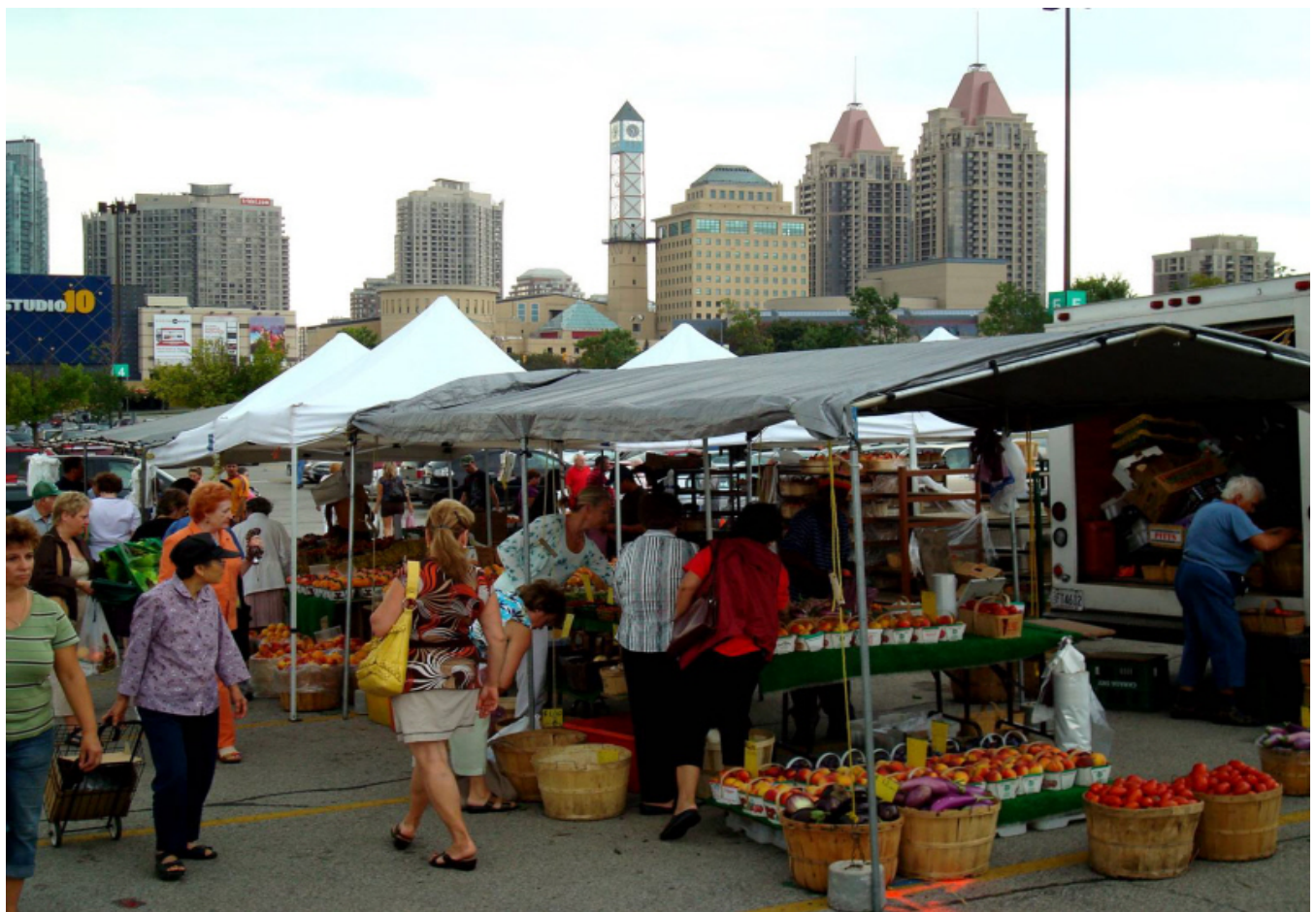
Figure 1-1: Formed in 1974, Mississauga is recognized as Canada's sixth largest city and Ontario's third largest city, with a population of over 730,000 residents representing cultures from around the world. Mississauga has many attractions and events that run at various times throughout the year. The Downtown is a central spot for activities, including the Farmers' Market.

Mississauga Official Plan provides a new policy framework to protect, enhance, restore and expand the Natural Heritage System, to direct growth to where it will benefit the urban form, support a strong public transportation system, and address the long term sustainability of the city. Mississauga Official Plan will be an important instrument in city building. All change within the urban environment will be considered for its capacity to create successful places where people, businesses and the natural environment will collectively thrive.