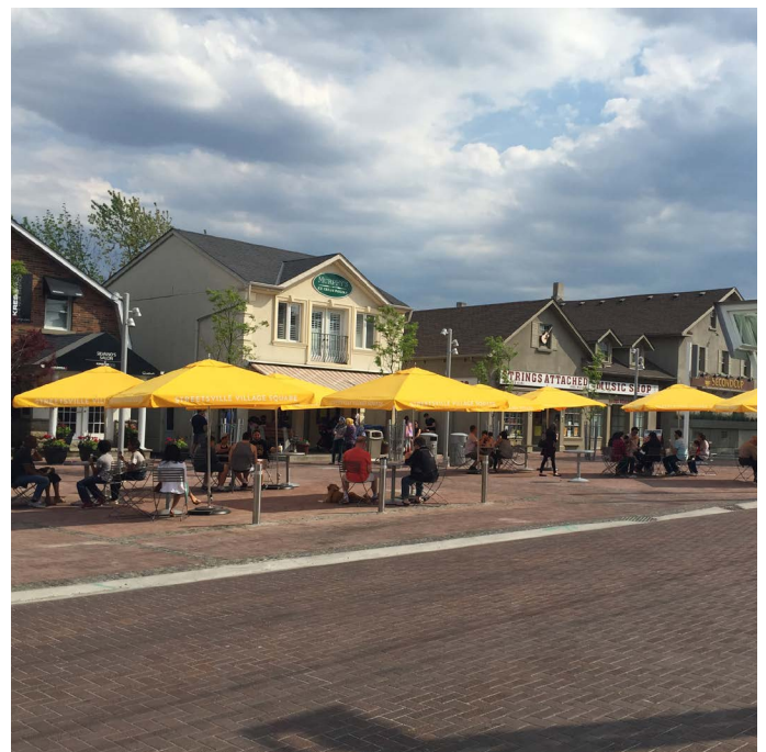
Main Street Square in Streetsville, Mississauga, is an example of a vibrant public square and community gathering place that could similarly be developed in Malton, as desired by residents.