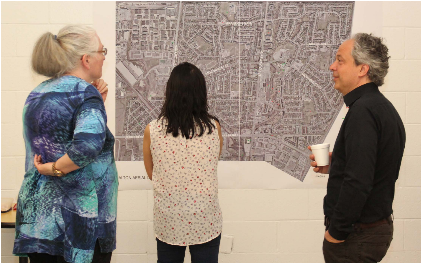
Residents participating in the dotmocracy exercise, where green and red dots were placed on a map of Malton to indicate the places they like, and the places they feel would benefit from improvement.