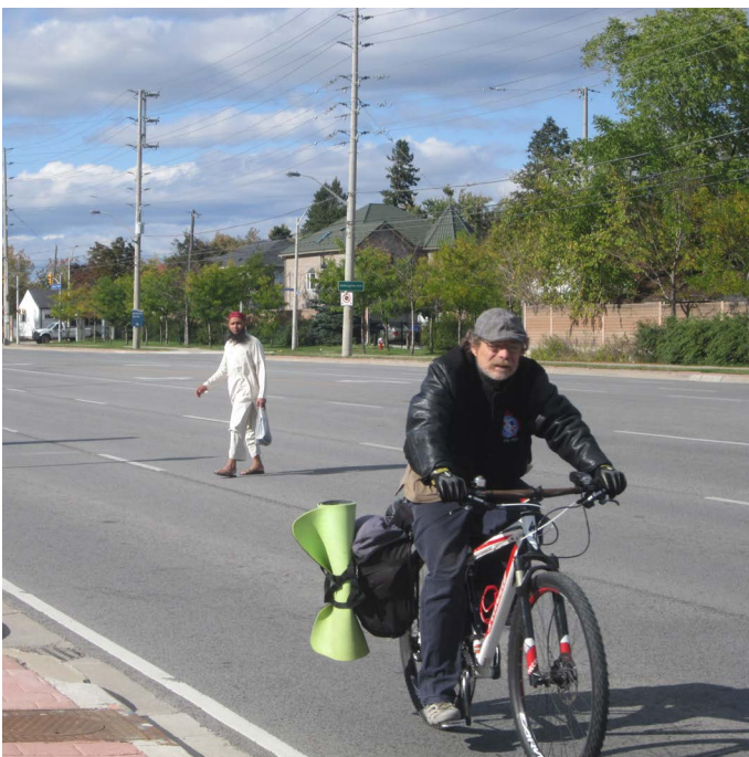
Airport Road receives its share residents travelling on foot and bicycle. Residents explained that Malton's streets would benefit from improved pedestrian and cycling infrastructure.

A lack of a central community gathering place or a public square was a frequent message heard during the consultations. Residents pointed to good examples found in other parts of Mississauga, for example Celebration Square in Downtown, or the Main Street Square in Streetsville. There is a strong desire for a community gathering place located in a central part of Malton with the capacity for supporting a variety of festivals that showcase local talent in the visual and performing arts, providing an opportunity to connect the community's many