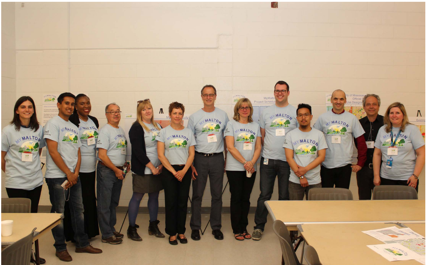
ABOVE: Staff from the City of Mississauga and Urban Strategies Inc. gathered together prior to the Community Visioning event.