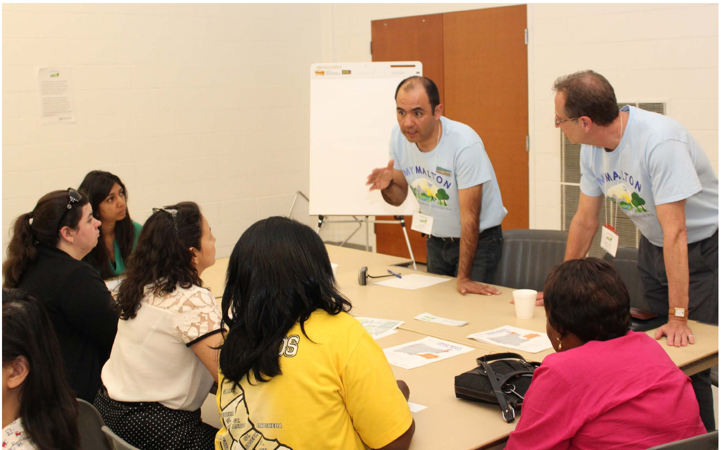
BELOW: Staff engaged with residents as part of several break out groups in order to facilitate the day's discussions.