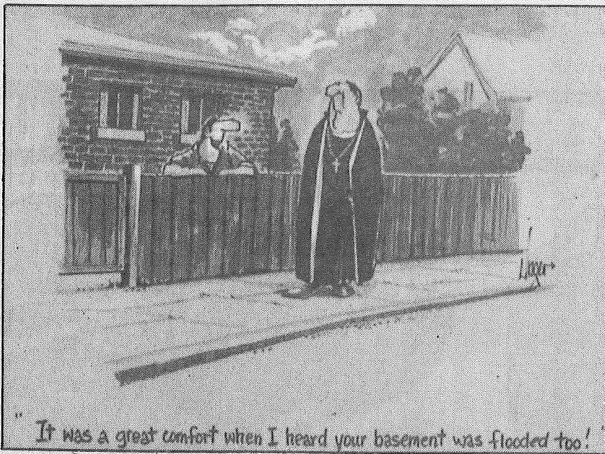
"It was a great comfort when I heard your basement was flooded too!"