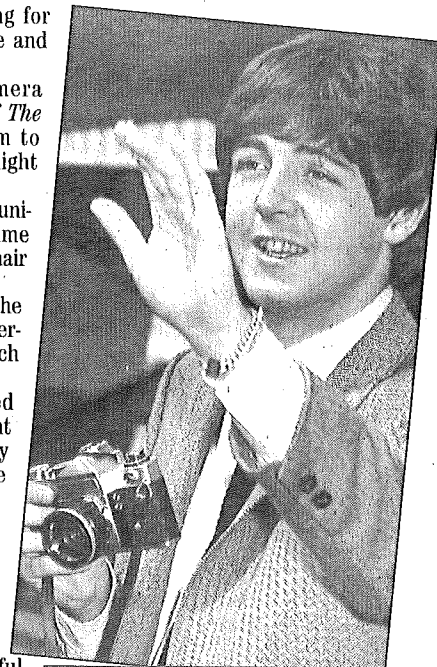
Dick Holborn captured a young Paul McCartney clowning with the press at Malton Airport when the Beatles arrived in 1964.

Holborn's photo album will be on display at Art's Photo Centre for several weeks. An 11-by-17 inch Beatles laser print costs $24.95.