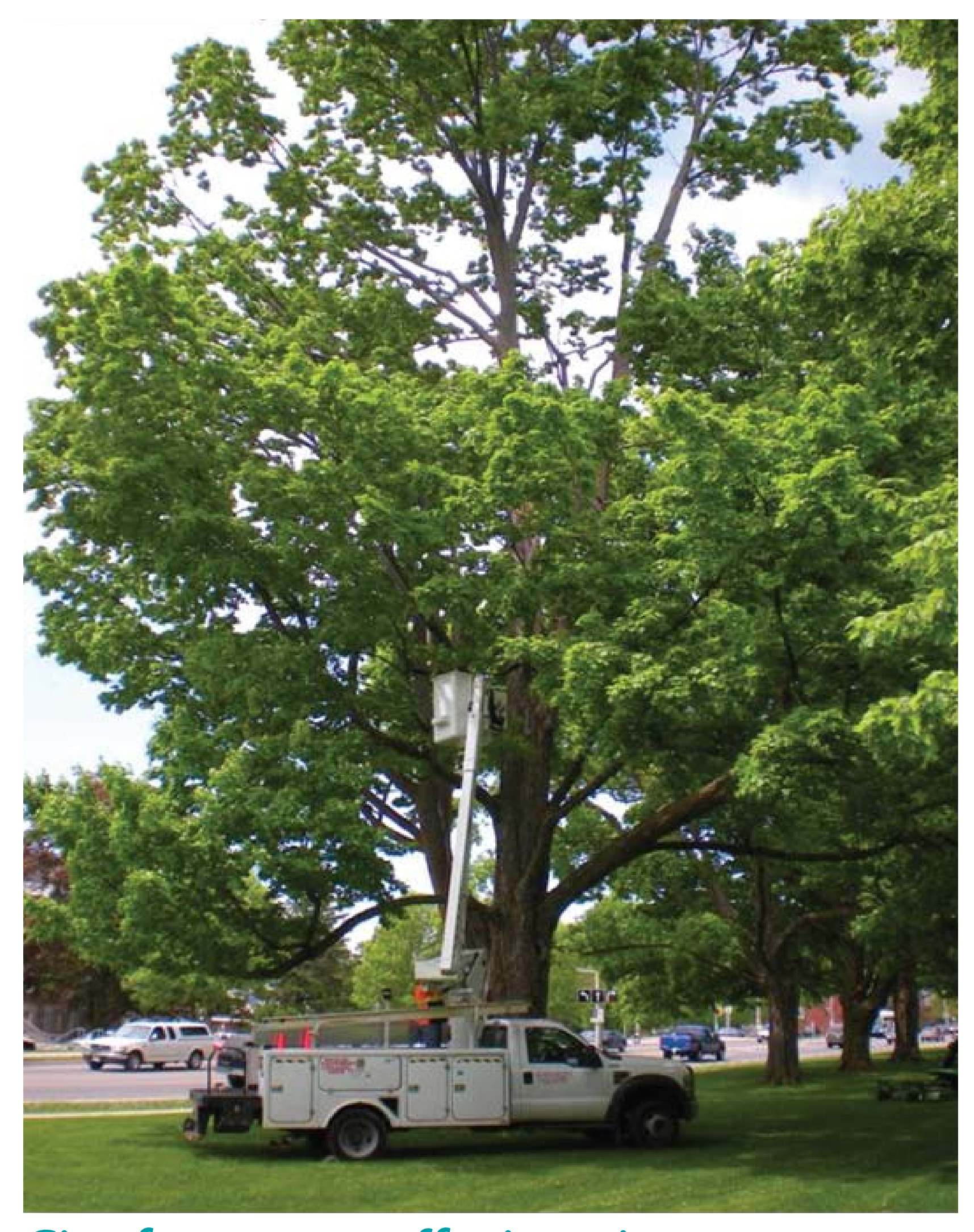
City forestry staff trimming tree

Deliverables for this project include two stand-alone documents - the Natural Heritage & Urban Forest Strategy (NH&UFS) and the Urban Forest Management Plan (UFMP). The Strategies are from the NH&UFS, while the supporting Actions are from the UFMP.