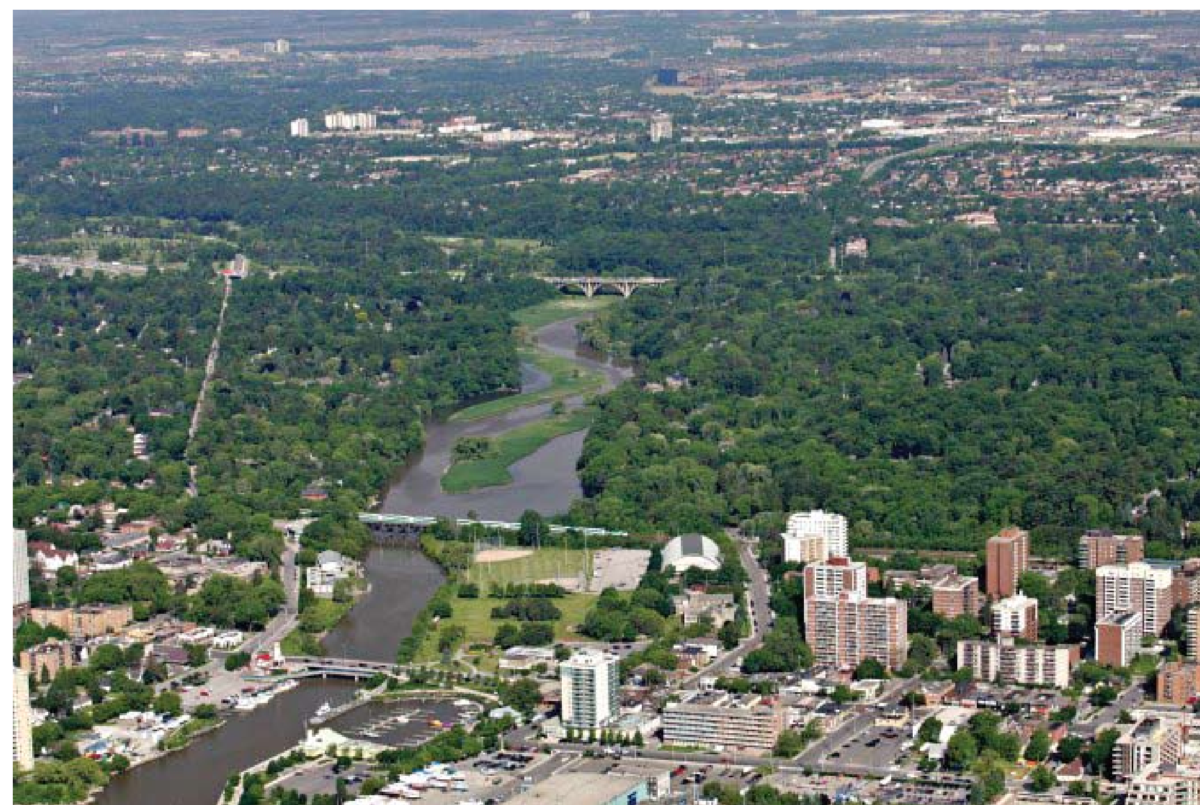
Aerial views along Credit River