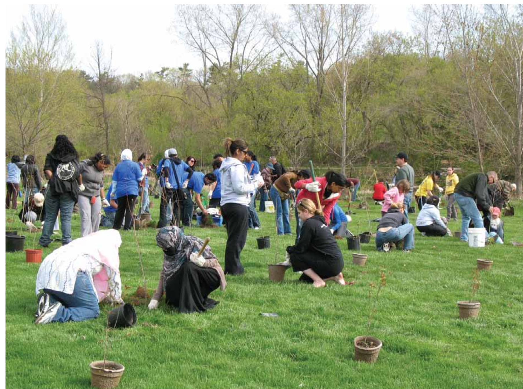
Community planting at Erindale Park