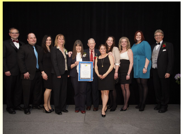
The City of Mississauga Team receives the 2014 Parks and Recreation Ontario Innovation Award for Play in the Park .