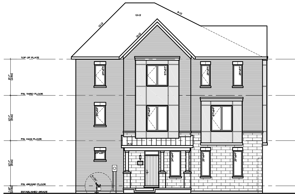
1 UNIT JTHD