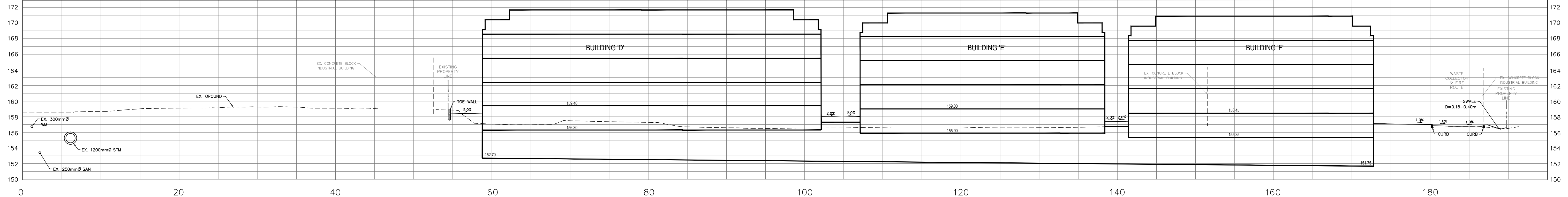
SECTION J-J SC 1:250