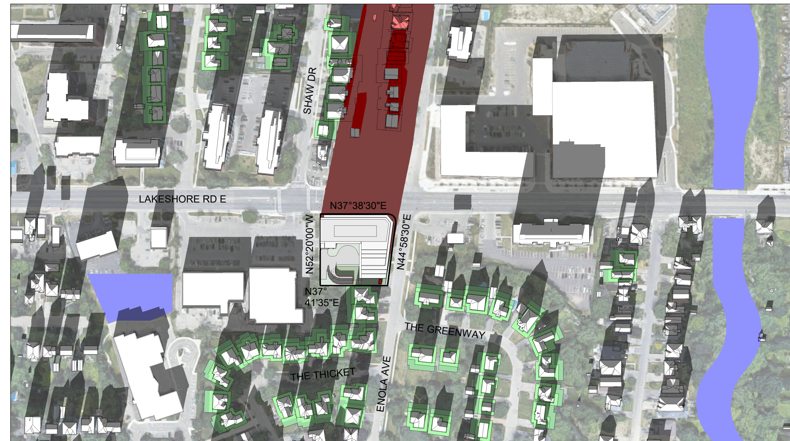
DECEMBER 21 - 9:19