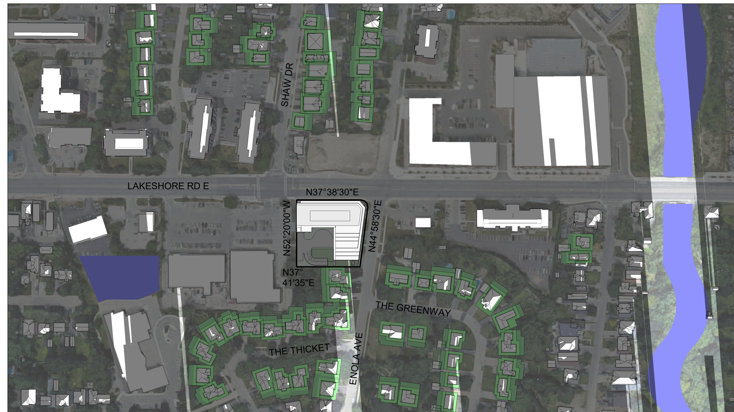
DECEMBER 21 - 7:49

This drawing, as an instrument of service, is provided by and is the property of Turner Fleischer Architects Inc. The contractor must verify and accept responsibility for all dimensions and conditions on site and must notify Turner Fleischer Architects Inc. of any variations from the supplied information. This drawing is not to be scaled. The architect is not responsible for the accuracy of survey, structural, mechanical, electrical, etc. information shown on this drawing. Refer to the appropriate consultant's drawings before proceeding with the work. Contractor must conform to all applicable codes and requirements of all relevant taxing jurisdictions. The contractor working from drawings not specifically marked for Contractor must assume full responsibility and bear costs for any corrections or damages resulting from his work.