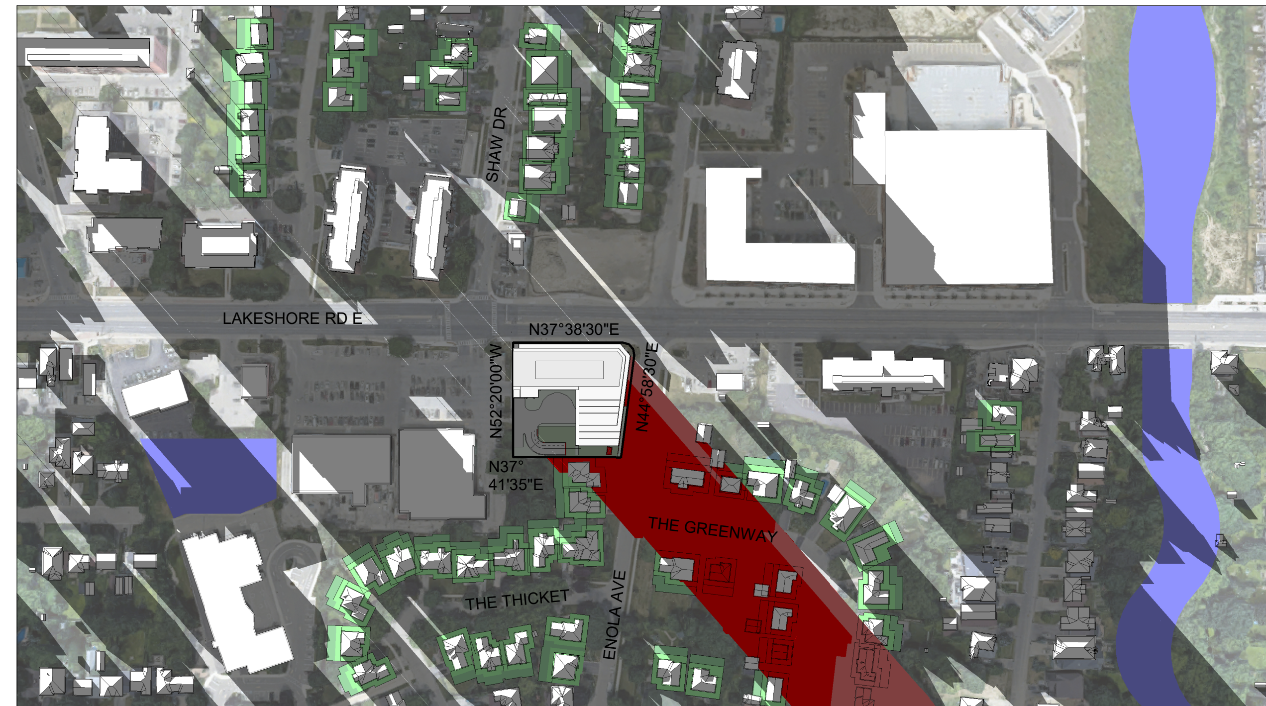
SEPTEMBER 21 - 17:48