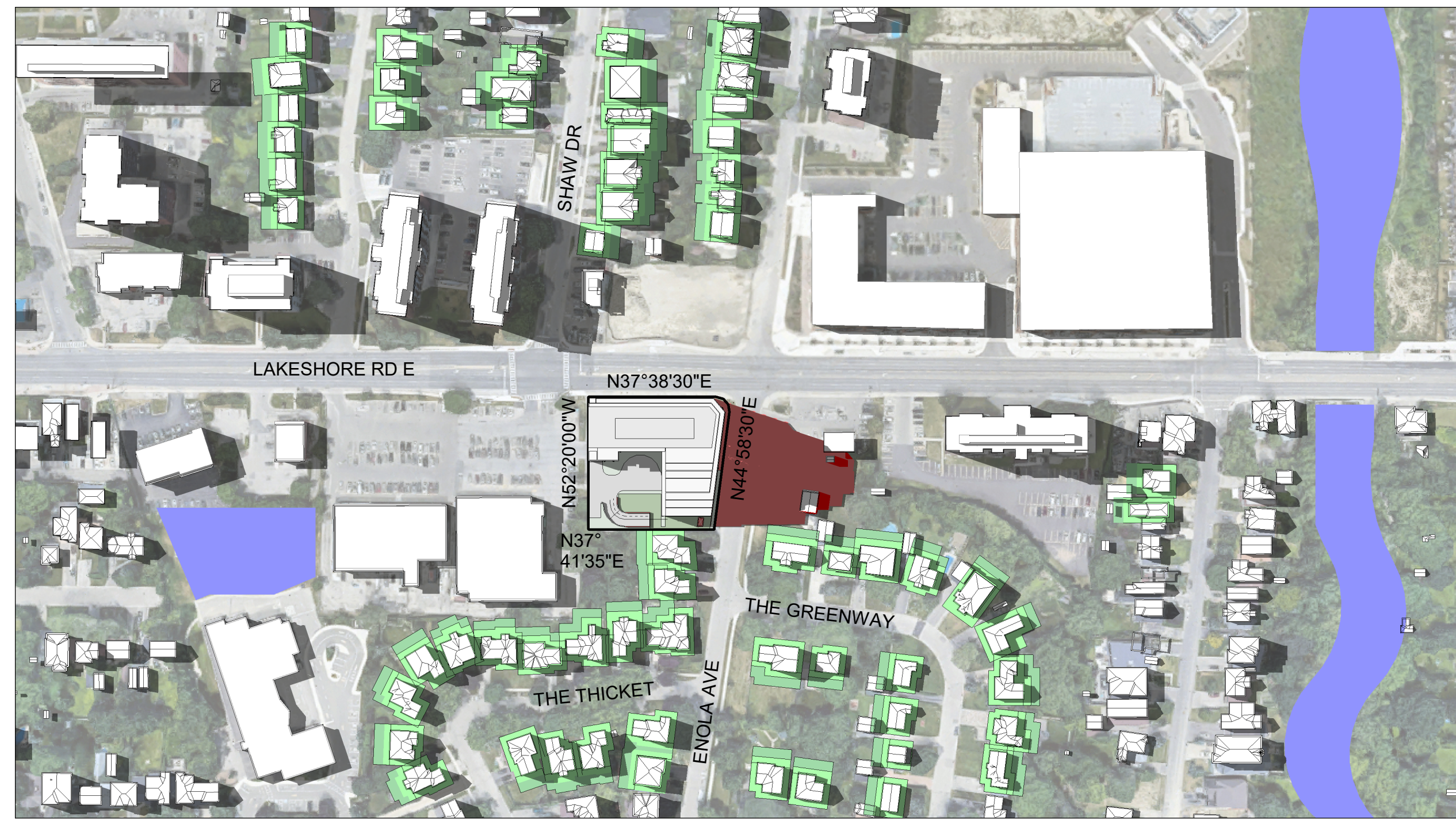
SEPTEMBER 21 - 15:12

This drawing, as an instrument of service, is provided by and is the property of Turner Fleischer Architects Inc. The contractor must verify and accept responsibility for all dimensions and conditions on site and must notify Turner Fleischer Architects Inc. of any variations from the supplied information. This drawing is not to be scaled. The architect is not responsible for the accuracy of survey, structural, mechanical, electrical, etc. information shown on this drawing. Refer to the appropriate consultant drawings before proceeding with the work. Construction must conform to all applicable codes and requirements of all relevant taxing jurisdictions. The contractor must assume full responsibility and bear costs for any corrections or damages resulting from his work.