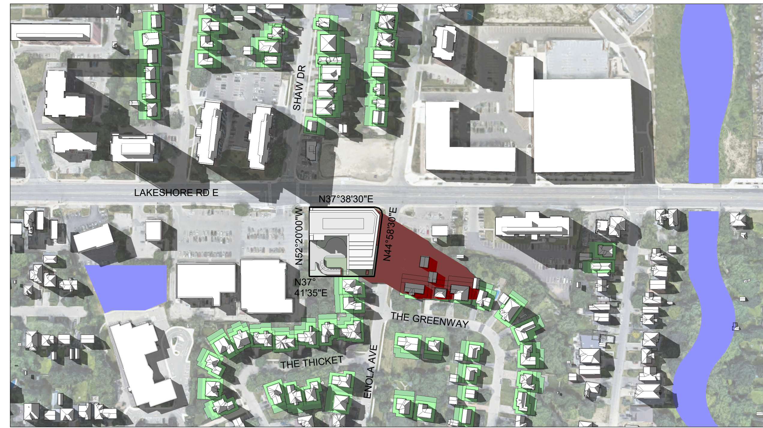
SEPTEMBER 21 - 16:12