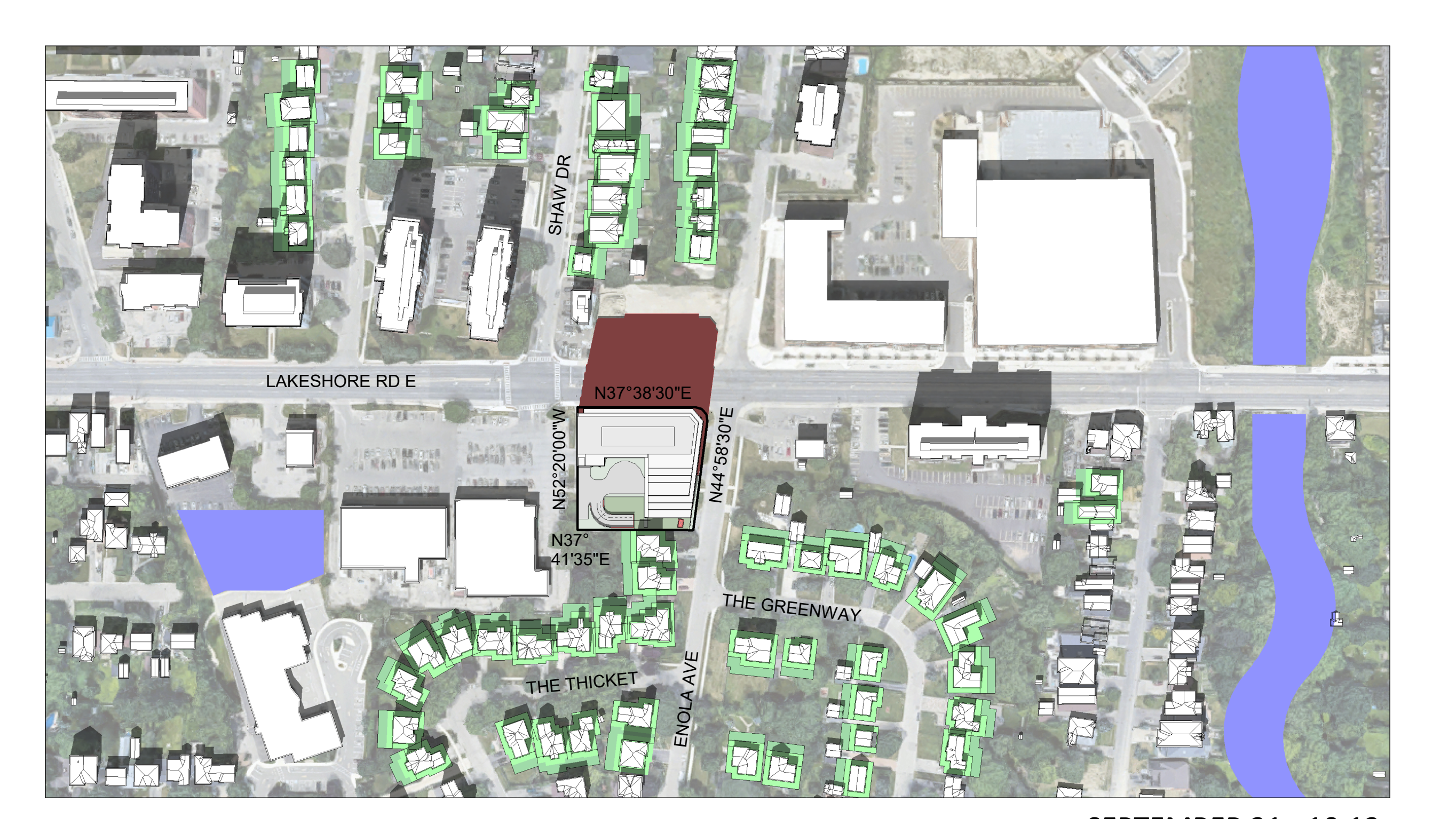
SEPTEMBER 21 - 10:12