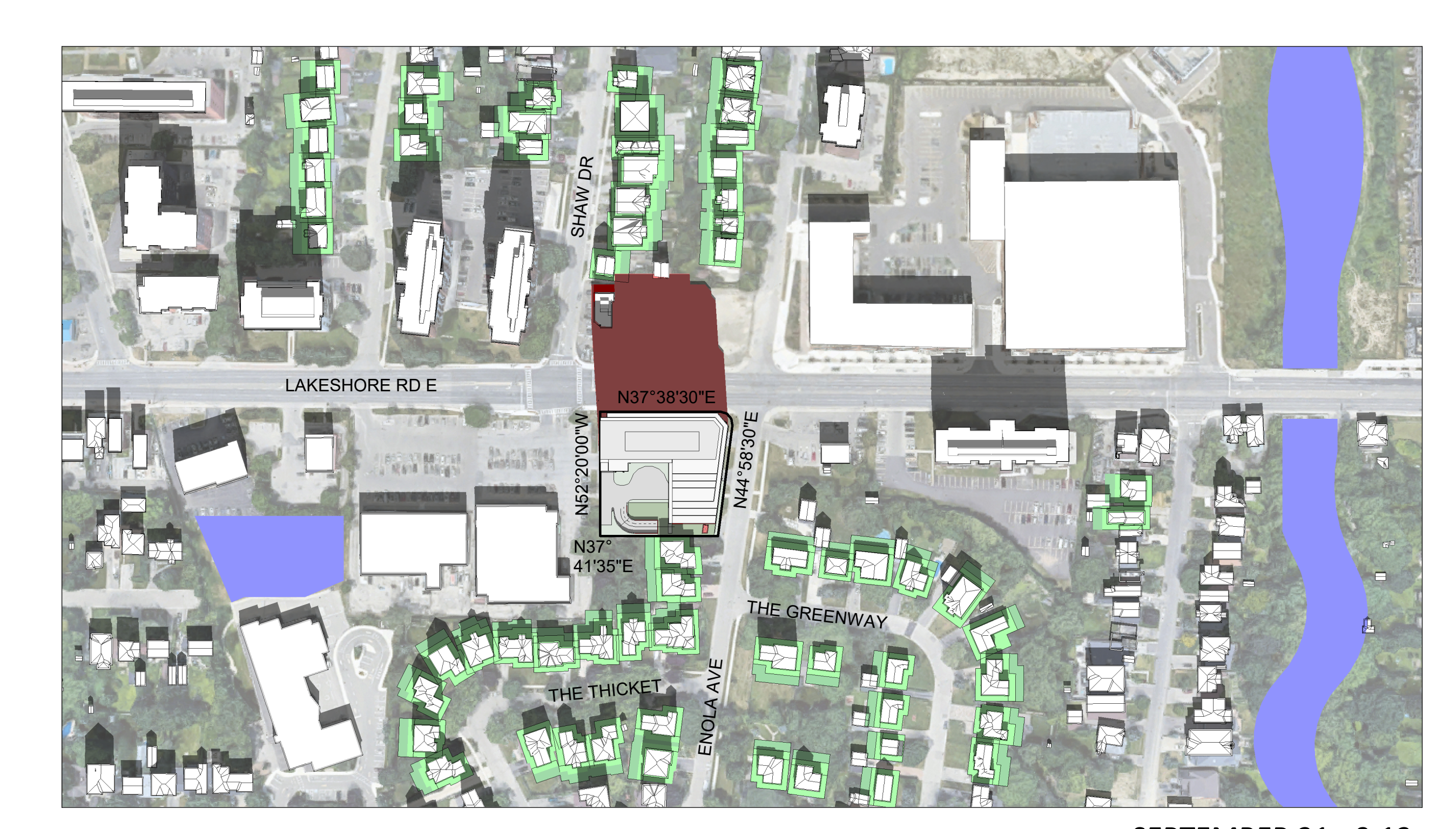
SEPTEMBER 21 - 9:12