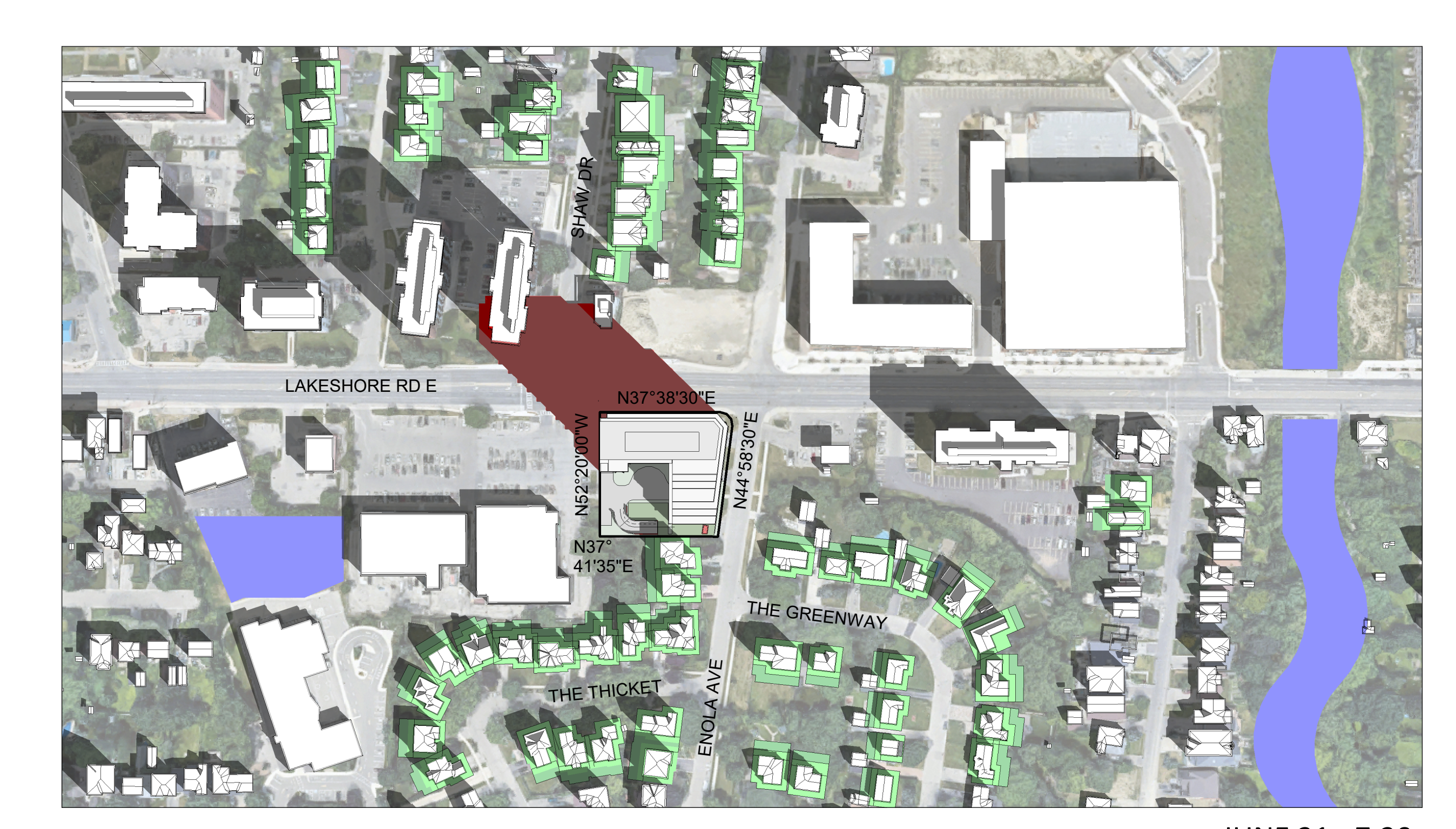
JUNE 21 - 7:20