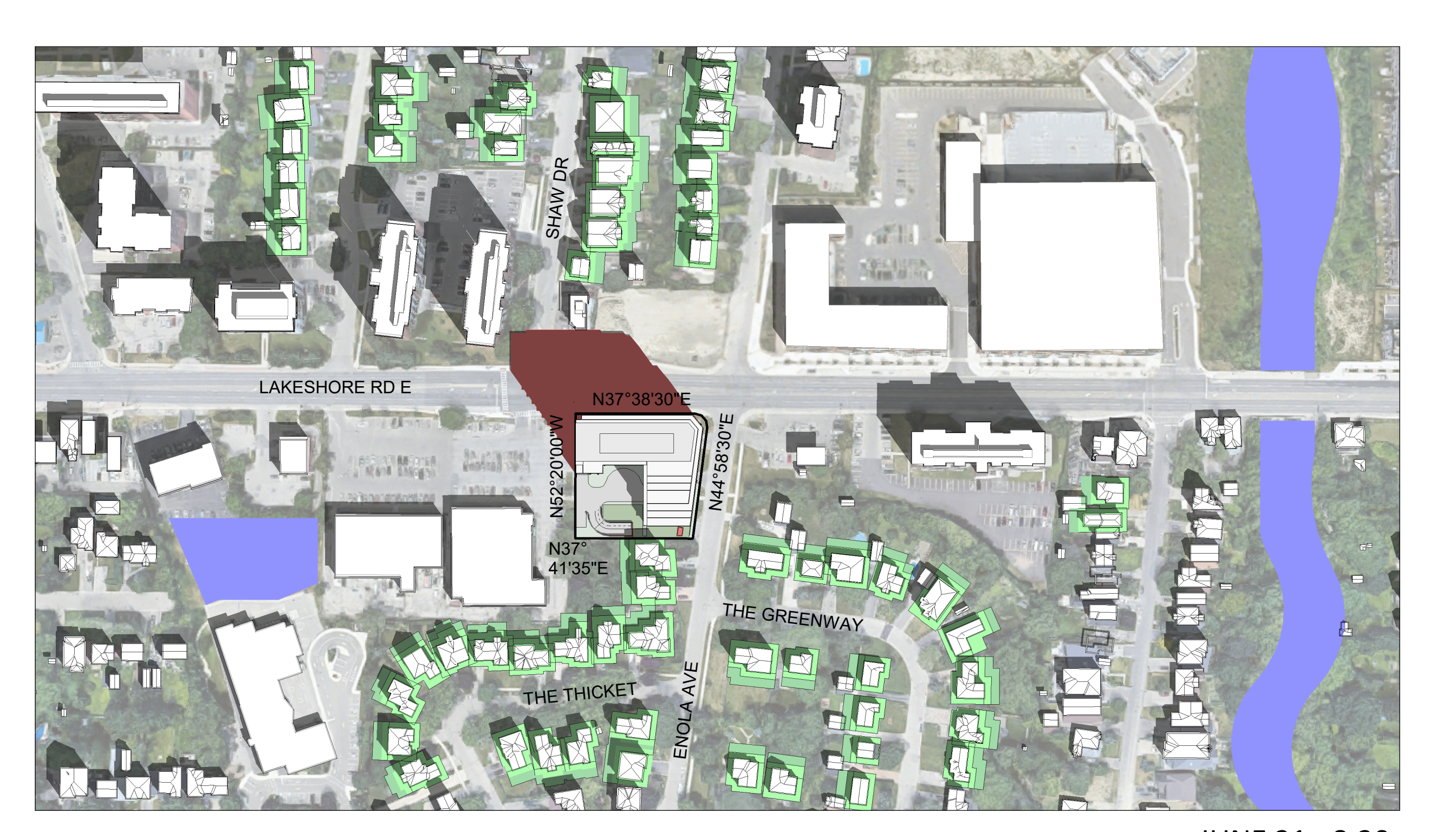
JUNE 21 - 8:20