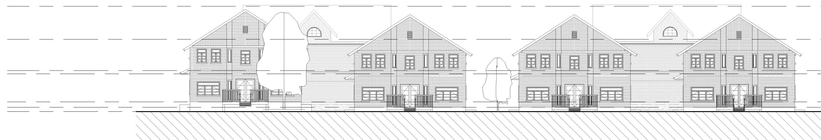
1 East Elevation 1 : 200