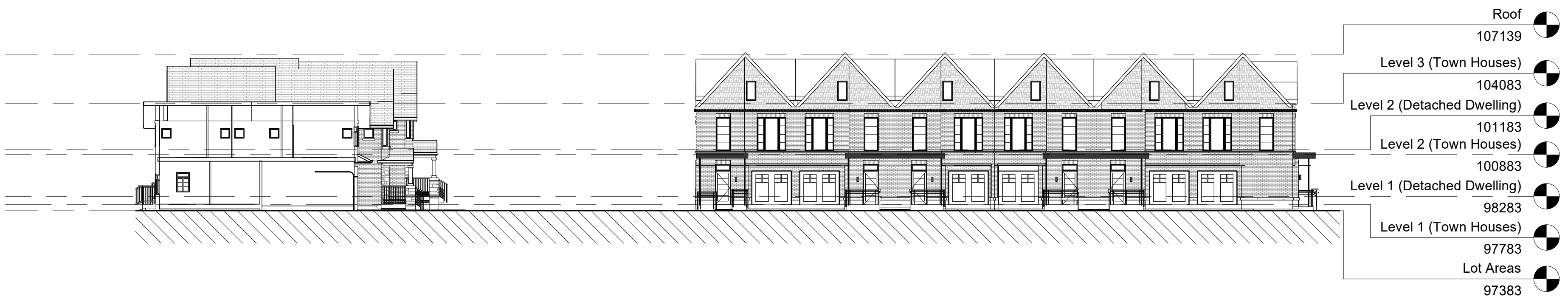
3 South Elevation 1 : 200