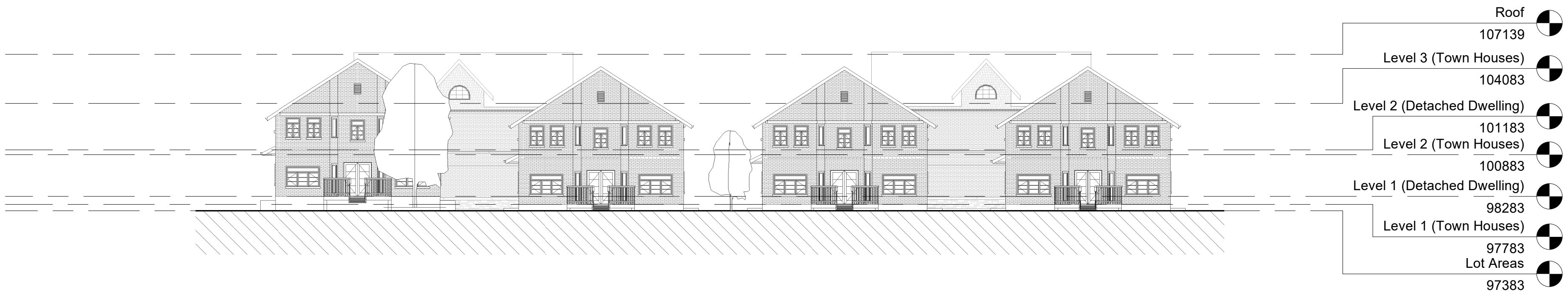
4 West Elevation 1 : 200