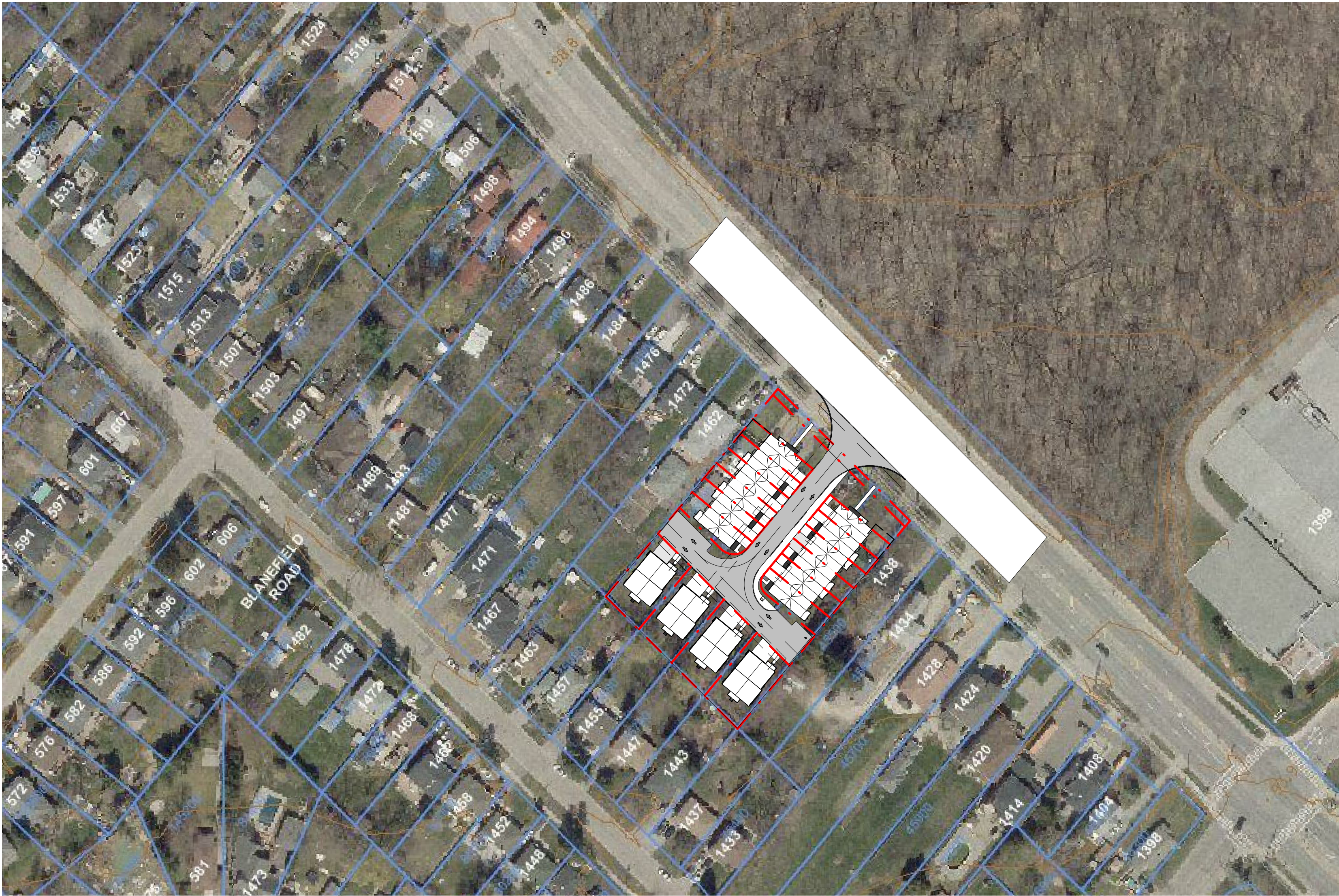
1 Context Plan 1 : 1000