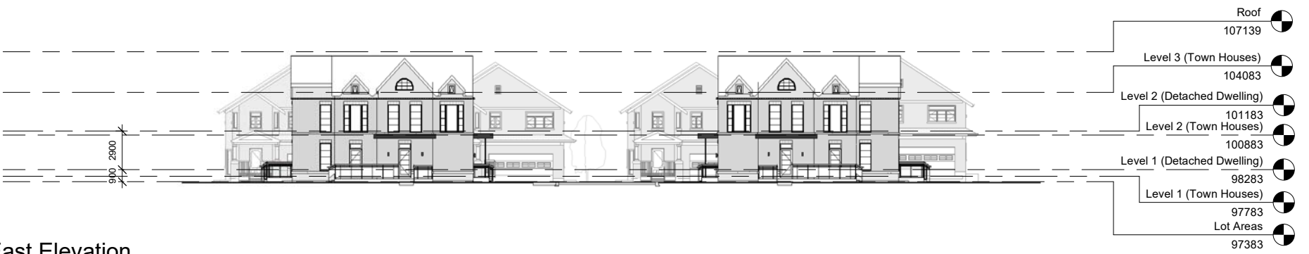
3 East Elevation 1 : 200