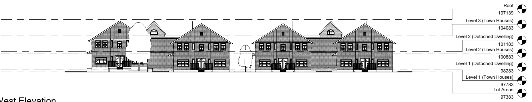
4 West Elevation 1 : 200