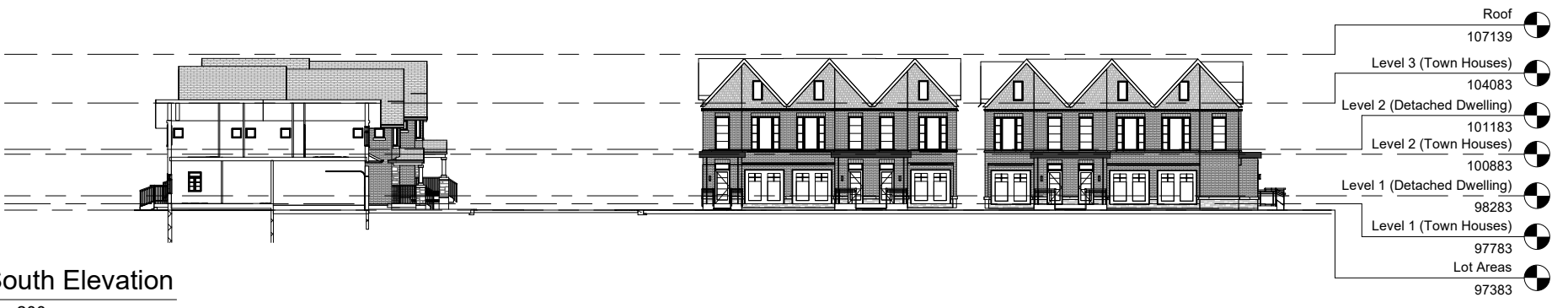
2 South Elevation 1 : 200