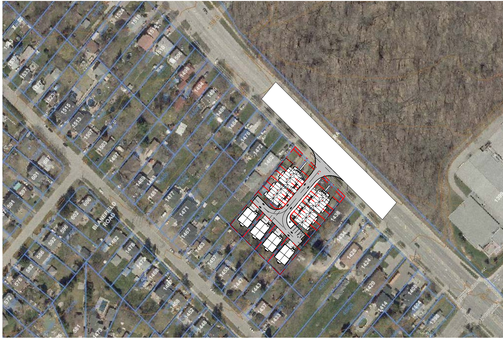
1 Context Plan 1 : 1000