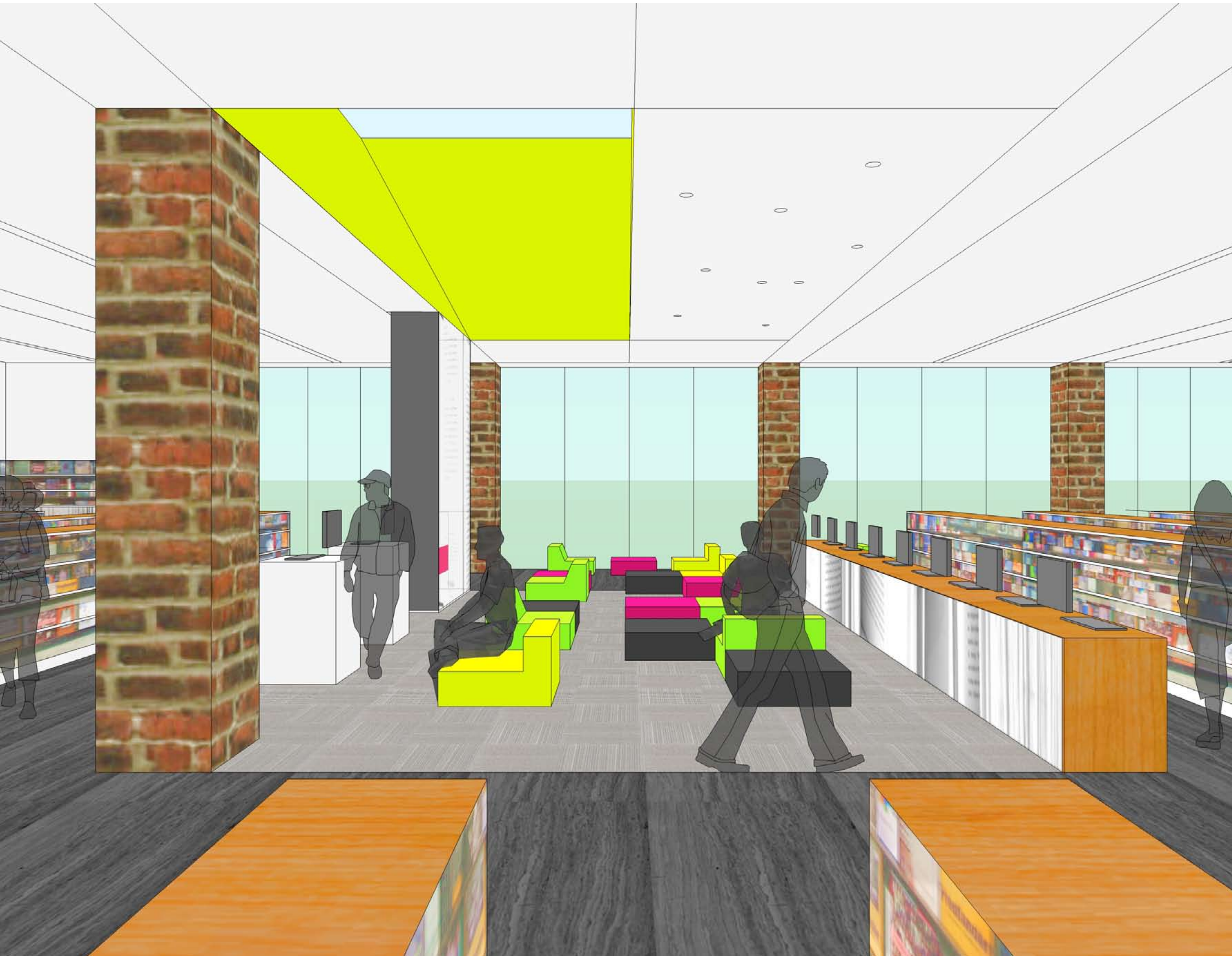
VIEW OF READING ATRIUM LOOKING WEST