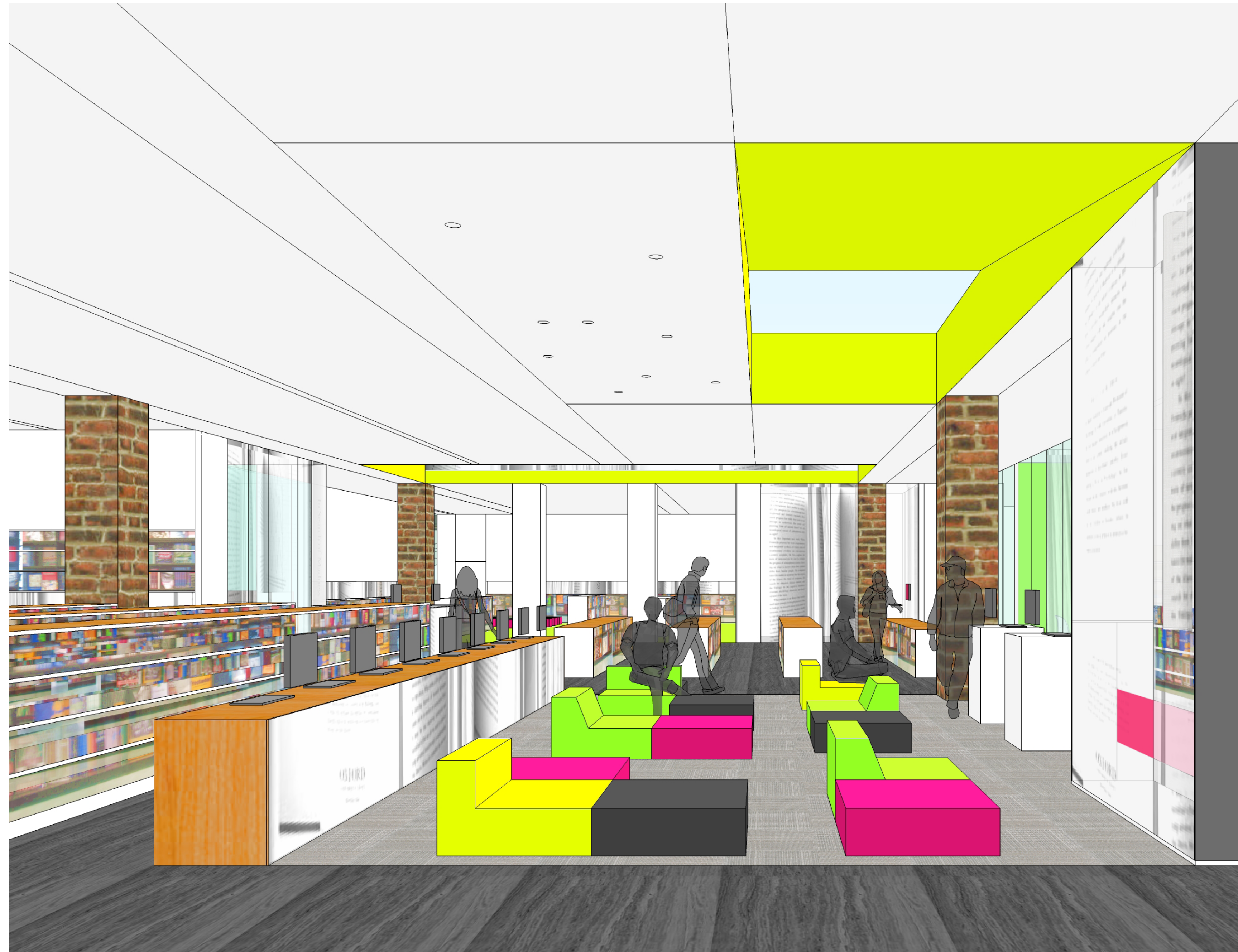
VIEW OF READING ATRIUM LOOKING EAST