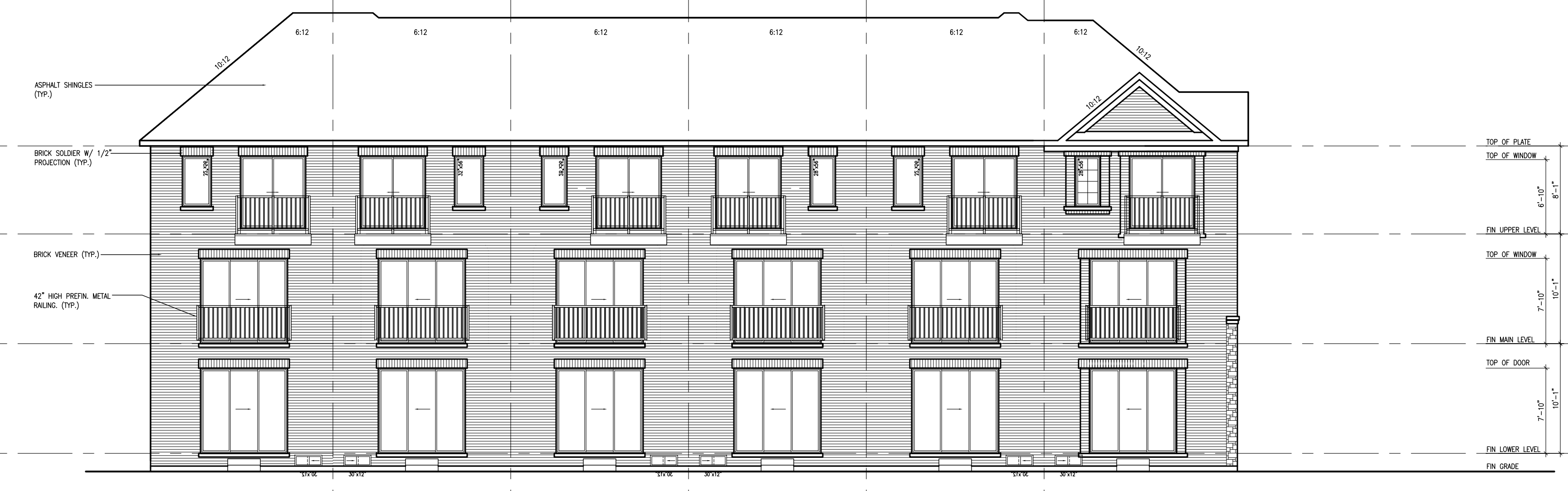
6 16TH-2 END ELEV. 'B' (REV.) 5 16TH-2 ELEV. 'B' 4 16TH-1 ELEV. 'B' (REV.) 3 16TH-1 ELEV. 'B' 2 16TH-2 ELEV. 'B' (REV.) 1 16TH-1E UPGRADE ELEV. 'B'