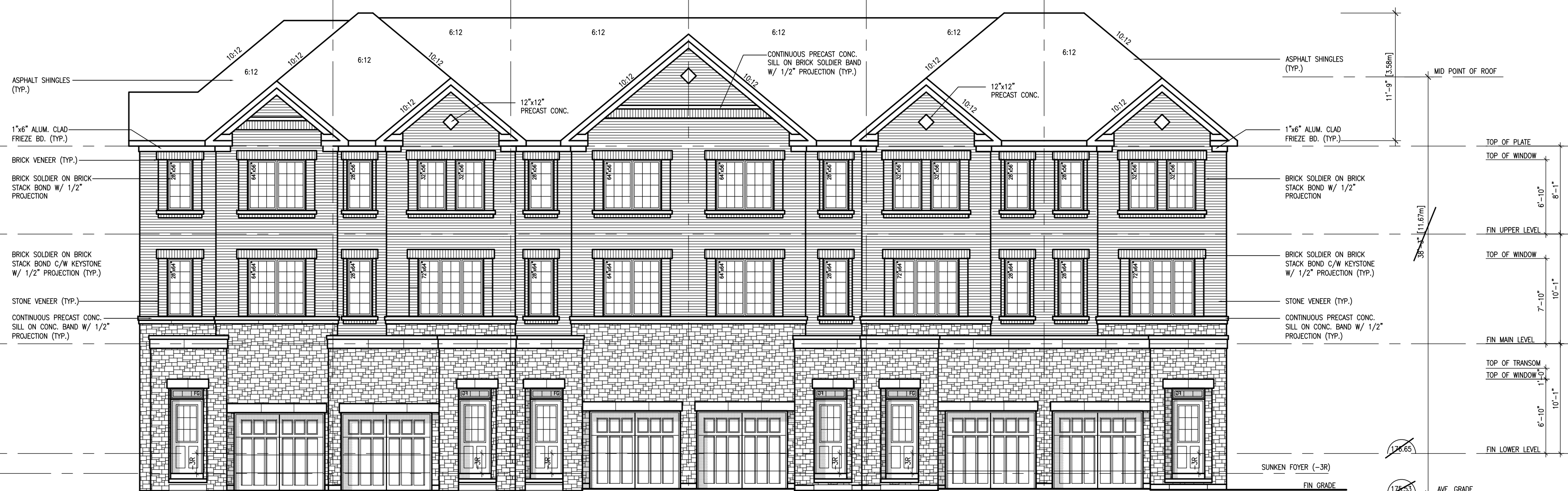
1 16TH-1E UPGRADE ELEV. 'B' 2 16TH-2 ELEV. 'B' (REV.) 3 16TH-1 ELEV. 'B' 4 16TH-1 ELEV. 'B' (REV.) 5 16TH-2 ELEV. 'B' 6 16TH-2 END ELEV. 'B' (REV.)