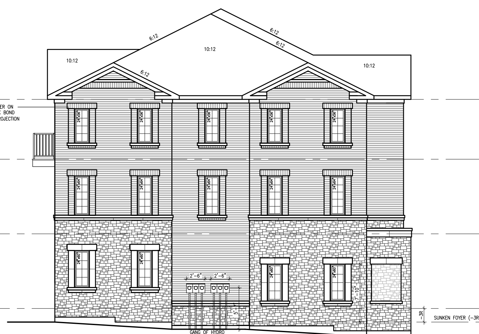
1 16TH-1E UPGRADE ELEV. 'B'