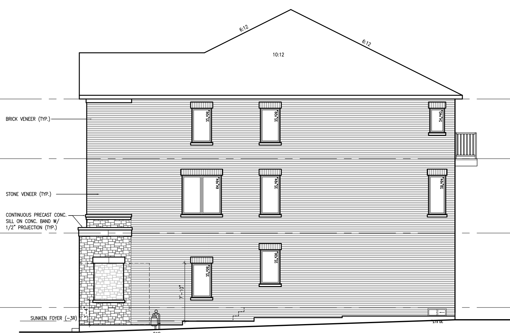
6 16TH-2 END ELEV. 'B' (REV.)