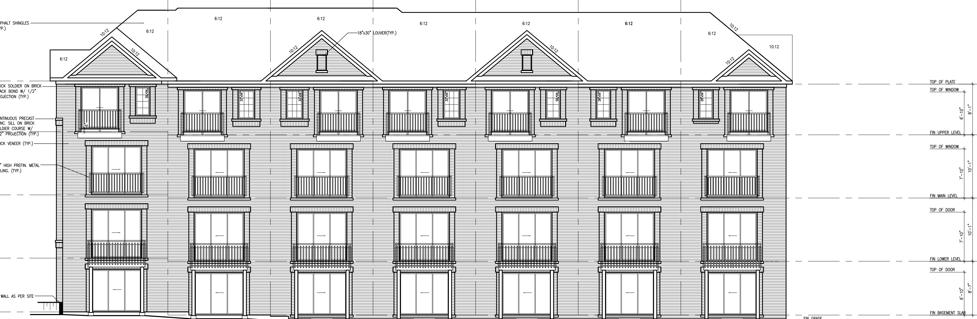
13 16TH-1E UPGRADE ELEV. 'A' (REV.) 12 16TH-2 ELEV. 'A' 11 16TH-2 ELEV. 'A' (REV.) 10 16TH-2 ELEV. 'A' 9 16TH-1 ELEV. 'A' (REV.) 8 16TH-1 ELEV. 'A' 7 16TH-2 END ELEV. 'A'