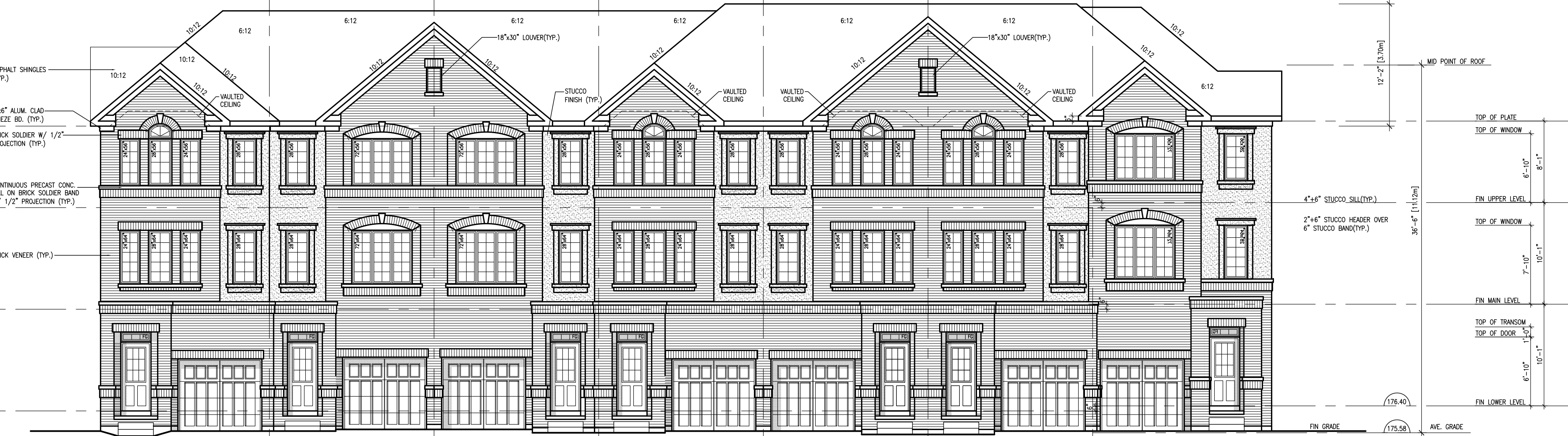
7 16TH-2 END ELEV. 'A' 8 16TH-1 ELEV. 'A' 9 16TH-1 ELEV. 'A' (REV.) 10 16TH-2 ELEV. 'A' 11 16TH-2 ELEV. 'A' (REV.) 12 16TH-2 ELEV. 'A' 13 16TH-1E UPGRADE ELEV. 'A' (REV.)