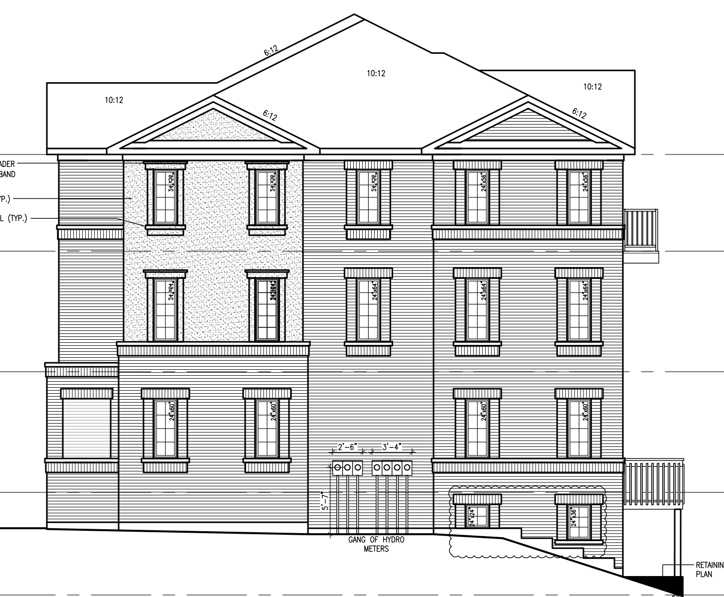
13 16TH-1E UPGRADE ELEV. 'A' (REV.) RIGHT SIDE ELEVATION