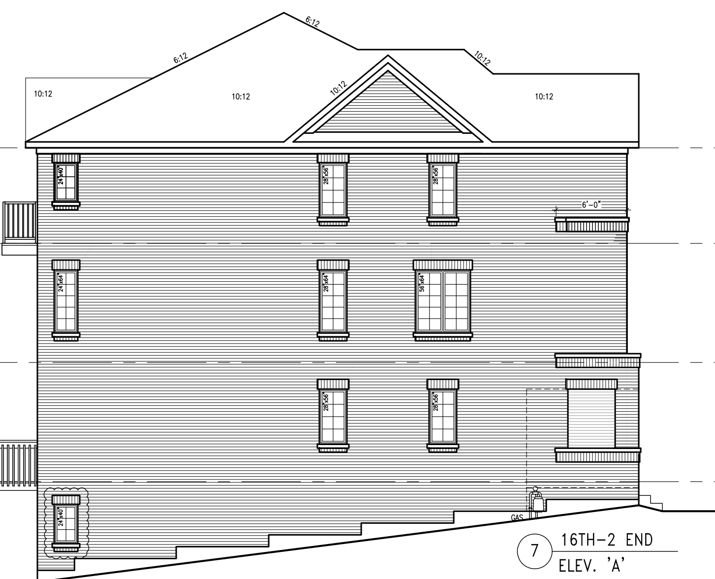
7 16TH-2 END ELEV. 'A' LEFT SIDE ELEVATION