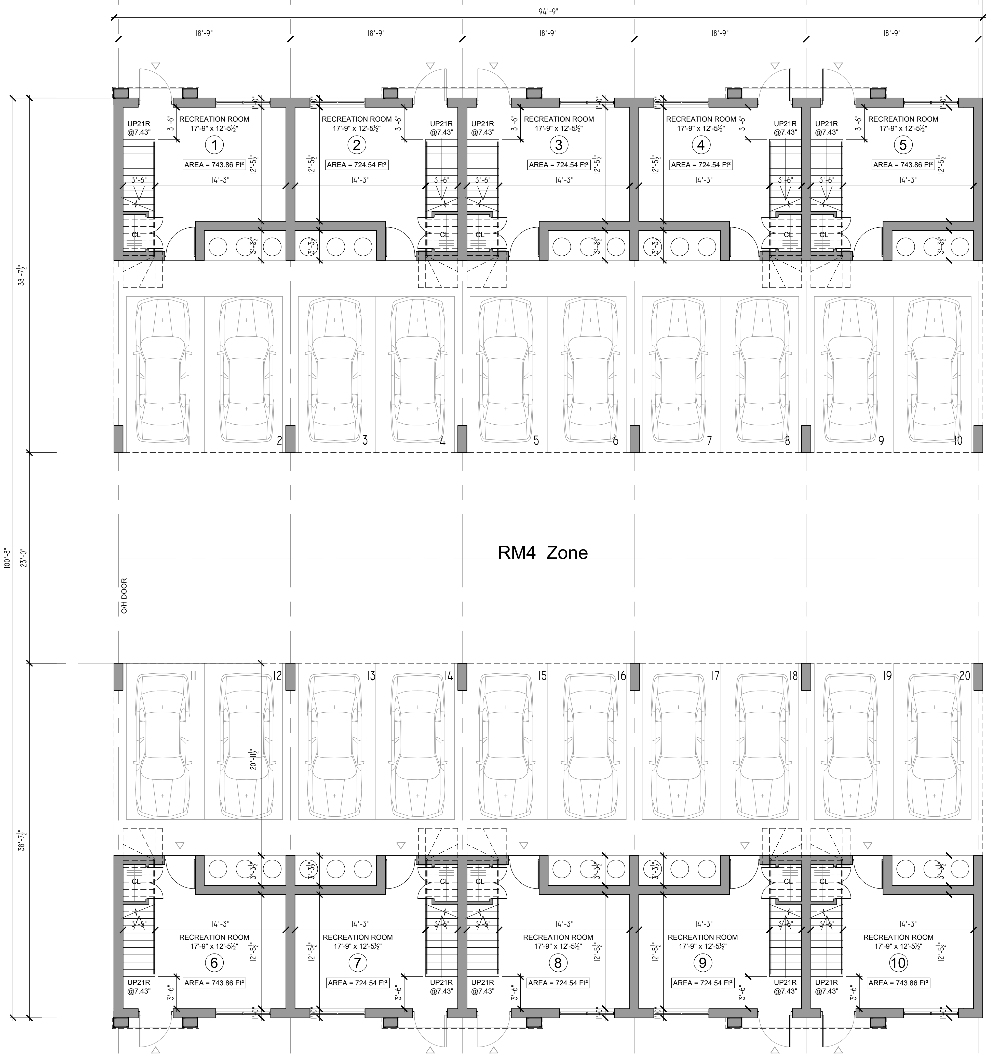
1 PARKING LEVEL (FIRST FLOOR) A2 SCALE: 3/16" = 1'-0"

CONTRACTOR SHALL CHECK AND VERIFY ALL DIMENSIONS ON SITE. ALL DRAWINGS ARE THE PROPERTY OF THE ARCHITECT AND MAY NOT BE USED WITHOUT HIS PERMISSION. THIS DRAWING IS NOT TO BE USED FOR CONSTRUCTION UNTIL COUNTERSIGNED BY THE ARCHITECT. DRAWINGS ARE NOT TO BE SCALED.