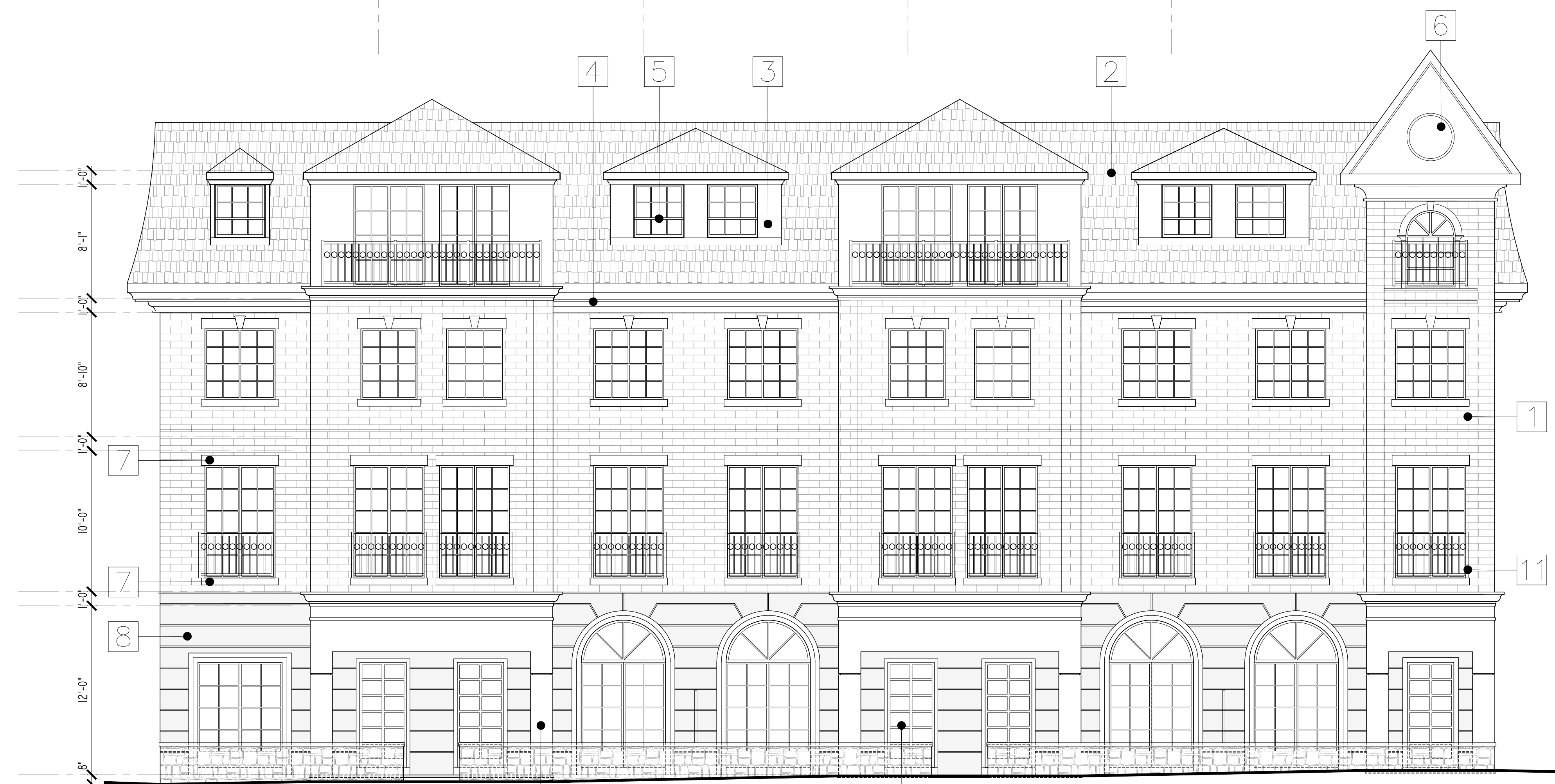
1 NORTH ELEVATION A3.1 SCALE: 3/16" = 1'-0"